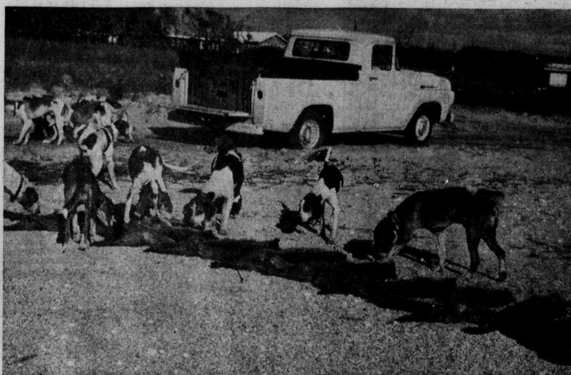
CATCH —The carcasses of 10 dead foxes are shown here laid out on the strand at Lang Beach following a two-day hunt held last week by hunters from upstate. Several dogs in the pack are shown sniffing their victims, while in the background is the truck used to transport part of the large number of visiting hounds to Brunswick. There is a full account of the hunt elsewhere in The Pilot.