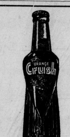
Distributed In This Area By Electric Bottling Co., Inc. WILMINGTON, N. C.

The defendant is being held in the Brunswick County jail in lieu of $1,500 bond. He will be given a preliminary hearing in Recorder's Court Monday.