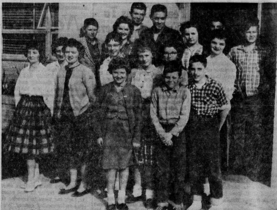
PART OF 4-H PROGRAM.—4-H Club members visit Brunswick E.M.C. in conjunction with their studies of electricity and information on power supply and operations of an electric Cooperative. Pictured is a group of Brunswick County 4-H'ers.