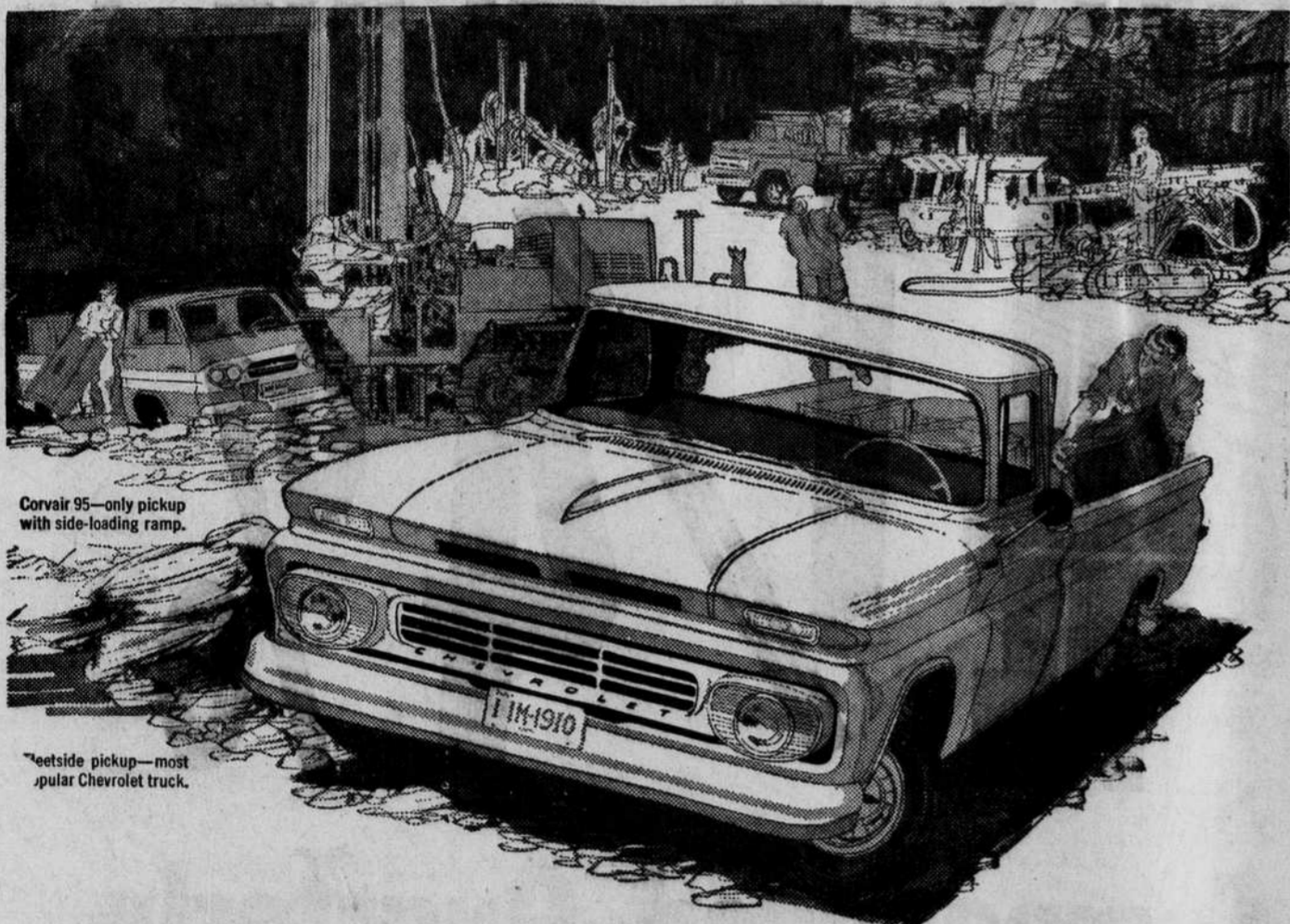
Corvaire 95—only pickup with side-loading ramp.