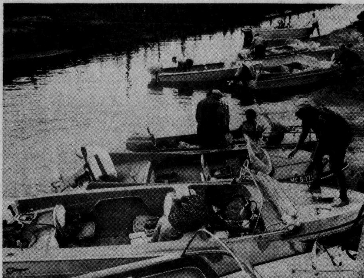
EMBARCKING —A group of boats from the Fayetteville Yacht Club are shown here at Tranquil Harbour Marina at Long Beach Sunday as they prepare for their trip down the Intracoastal Waterway to Calabash and return. Twenty boats and more than fifty persons made the trip.