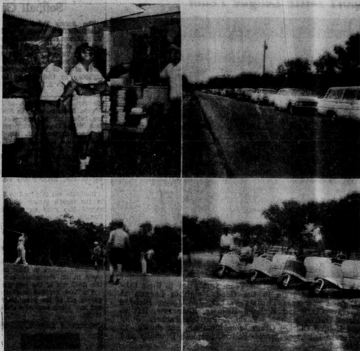
Golf is the center of sports interest in Southport and nearby beach areas since Oak Island Golf Club opened for play on July 4. Above is a scene in the temporary pro shop and on the right is a view of parked automobiles near the No. 1 tee. Lower left shows a group of players and spectators and on the right are electric golf carts ready for the golfers for whom the trip around the course on foot is an unwelcome thought.

fund which is growing larger each year, and in time will be used to advance outstanding talent among the members of the Hayman clan.