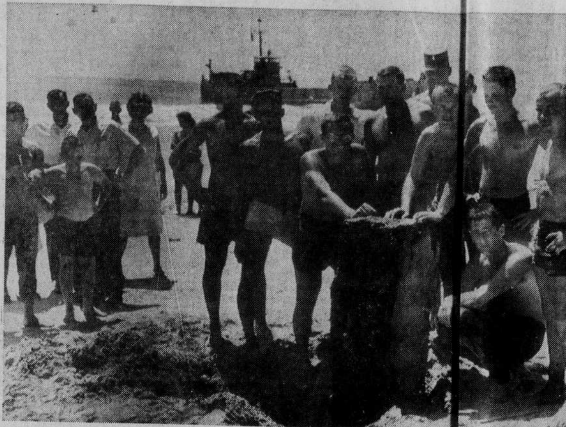
Case of weapons buried temporarily in wet sand at Holden Beach. Crew stands by and LCU is shown in background on beach.

There is no connection between the local weekend activity and that of the salvage operations off the coast of New Hanover County. The local efforts were carried out by the Army team from Fort Eustis, Va., which was at Sunny Point last week on routine training operations. Word of the interesting recoveries being made at Fort Fisher prompted a request for permission to undertake a similar project at one of the known wrecks off the