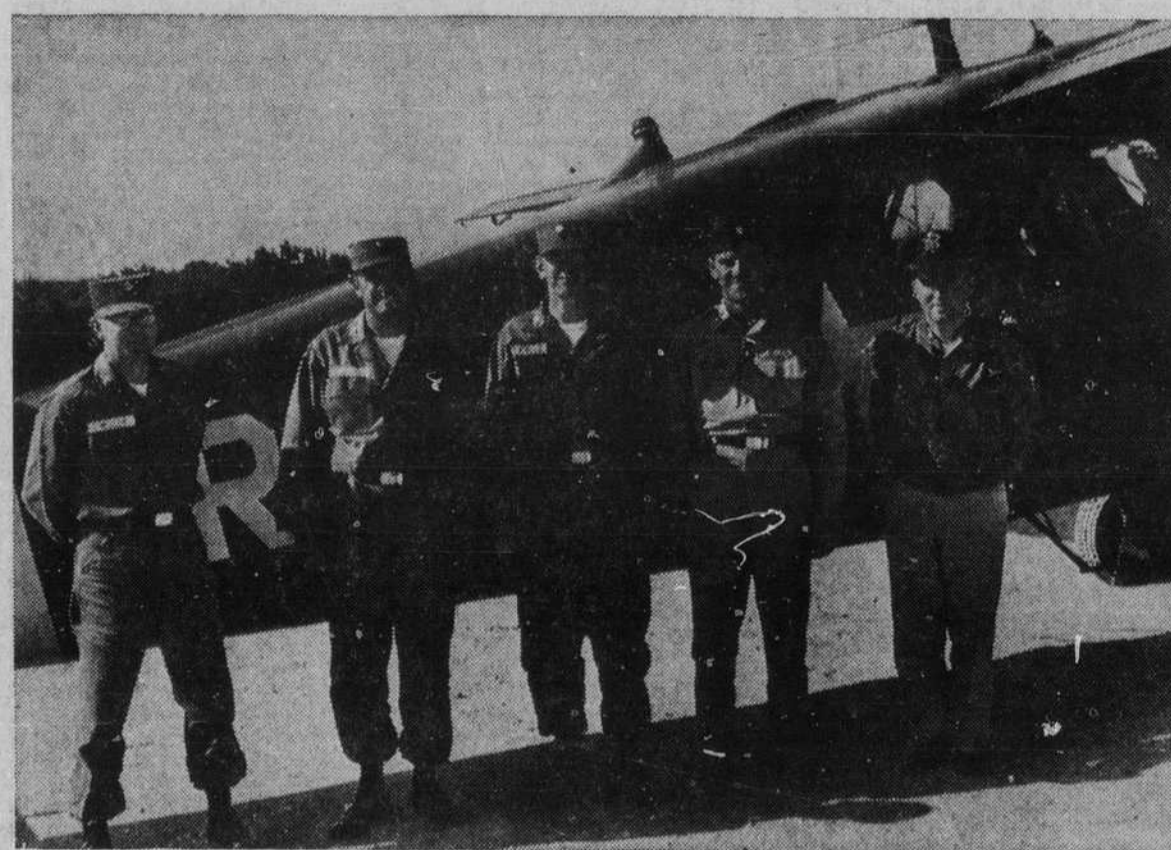
PLANNING —U. S. Army officers from Fort Eustis, Virginia, shortly after their arrival this week at Sunny Point Army Terminal for the planning of the large scale Army maneuvers which are to take place in this area and on Bald Head Island during October.