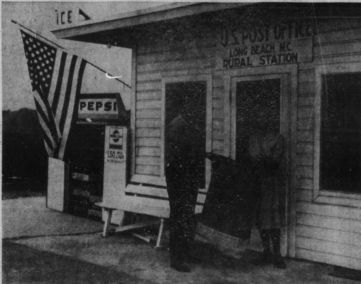
WORKING —Dan Shannon, head clerk at the new Long Beach Post Office, is shown here handing a mail bag to Mrs. Ellen Gilmore, assistant clerk at the office. Formerly only a summer activity, the rural station will now be a year round operation.