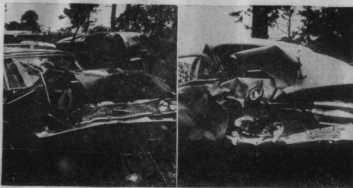
SMASHED—On the left is the Parker station wagon which was totally destroyed in a head-on collision Friday afternoon with the Simmons car, right, which also was a total loss. No lives were lost in the accident, but five persons were hospitalized.