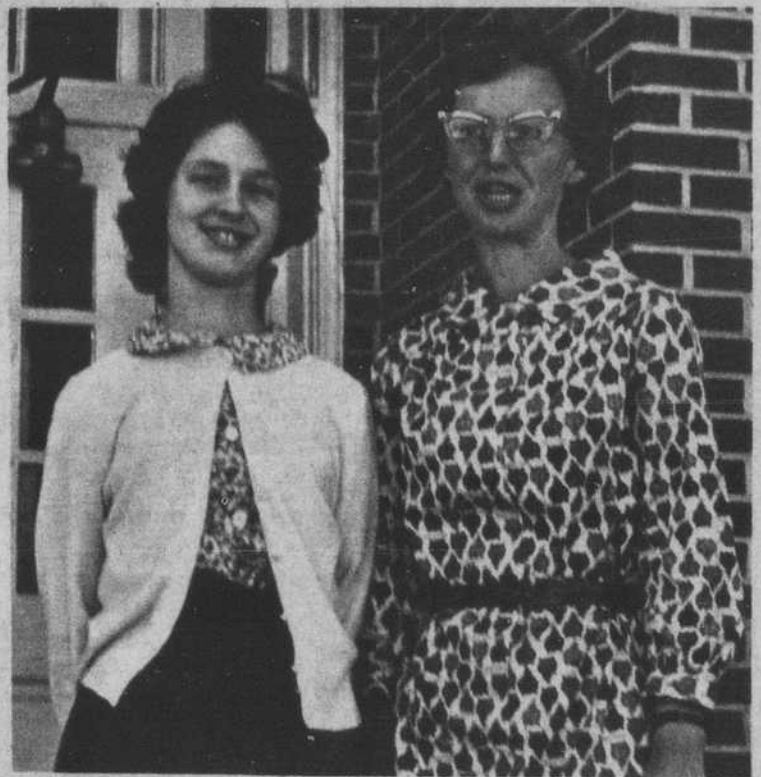
Spelling Bee Winner

A Curriculum Fair will be the highlight of the final PTA meeting of the school year to be held at the school on Thursday, April 22. Each class will have on exhibit examples of the work done during the year. The Science Department exhibits will be set up according to the standards outlined by the State Science Fair. It is important that the parents be present for this meeting.