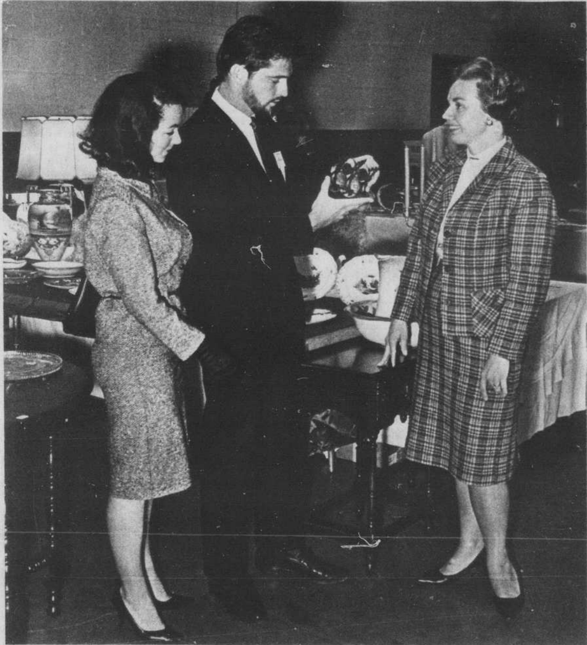
Visits Antique Show