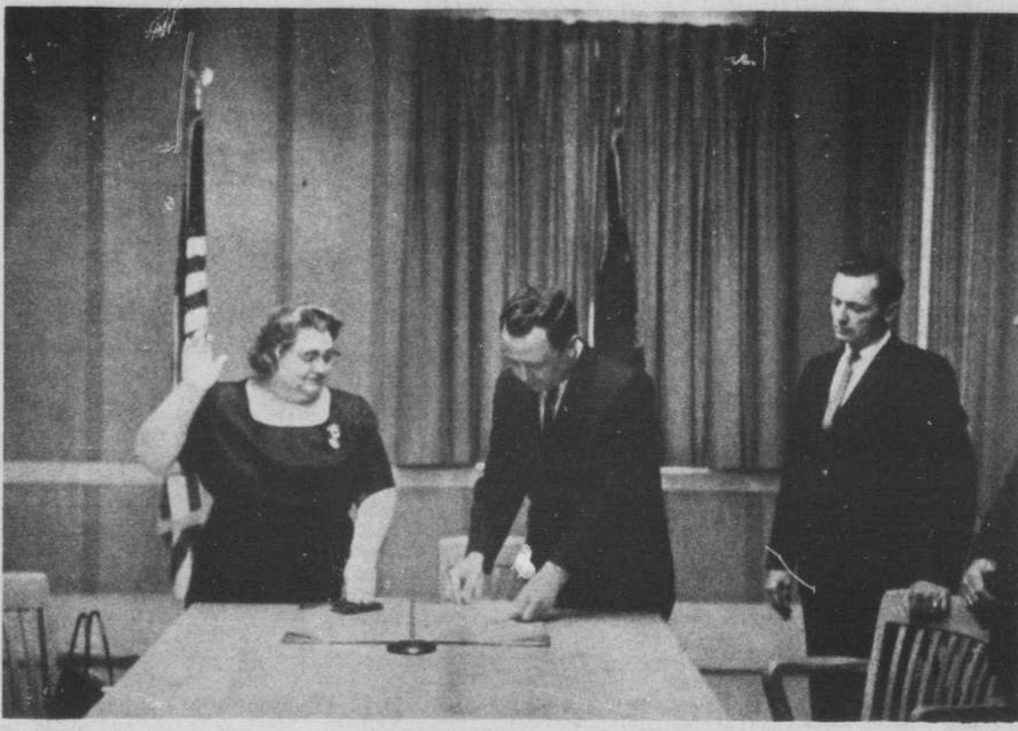
First Woman Alderman

The program in essence, speakers said, is a "money-making" promotion. The idea is designed to provide employment and thus add taxpayers. Whether county people plan to (Continued On Page 4)