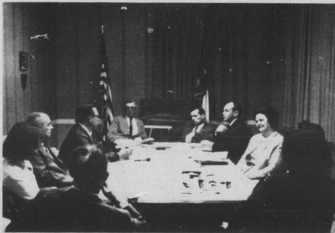
Consider Library Building Plans

Other programs: Health care (Continued On Page 12)