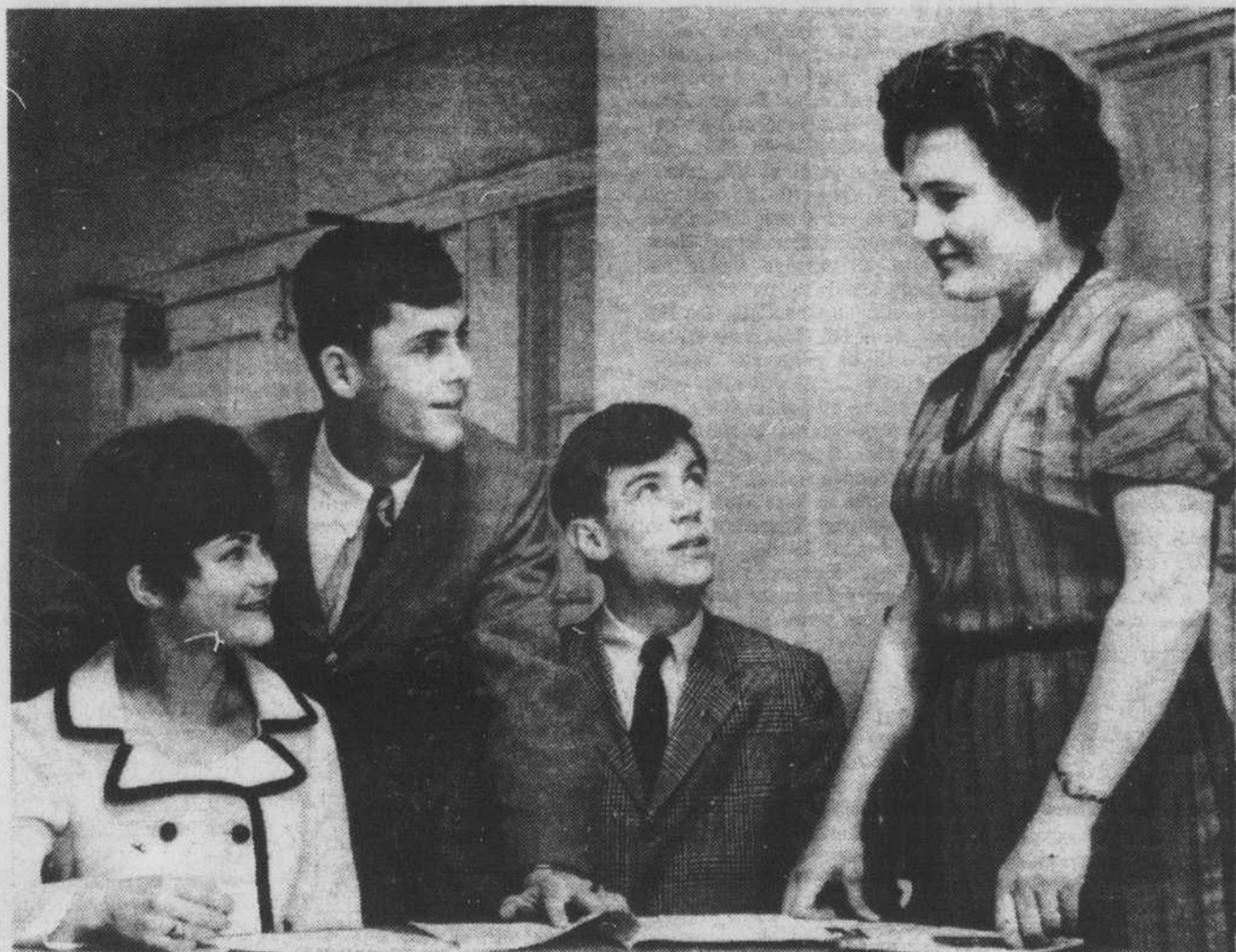
Shalotte Girl State Officer