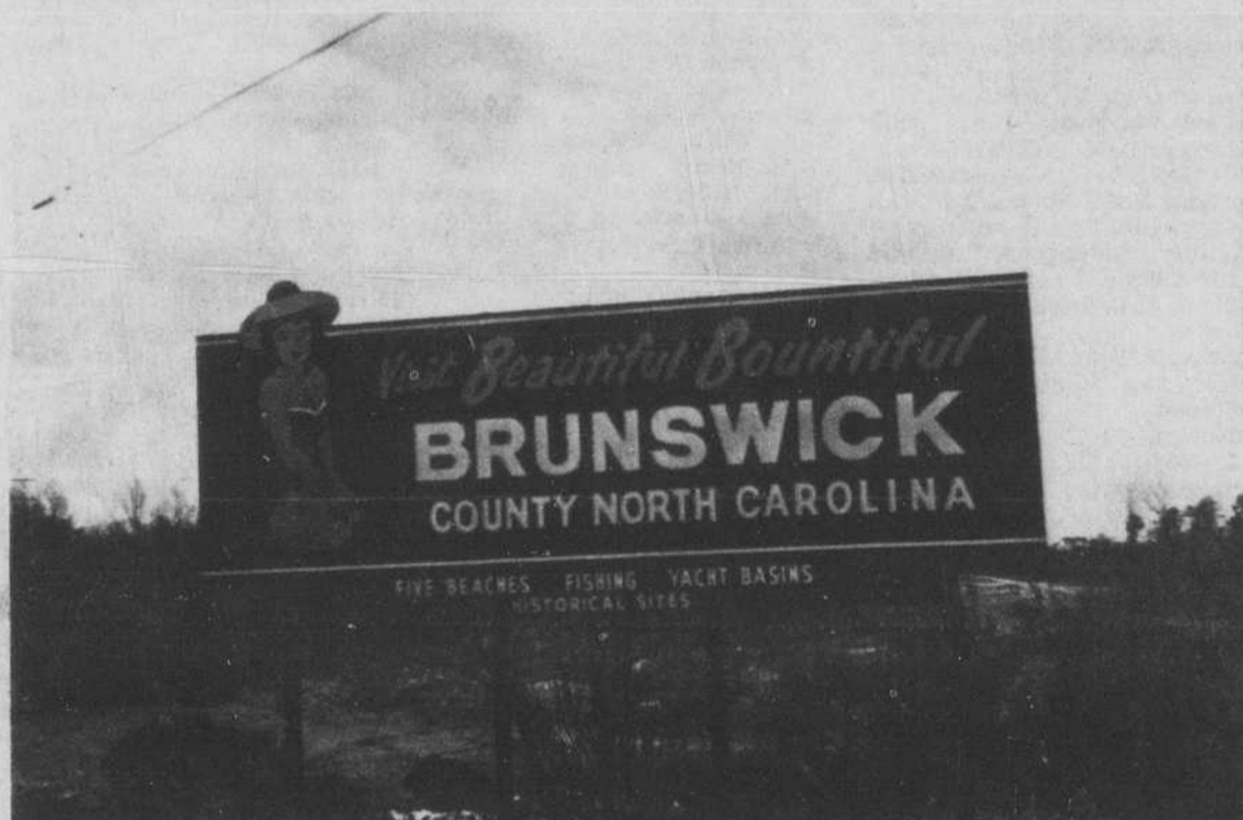
Signboards Proclaim Brunswick