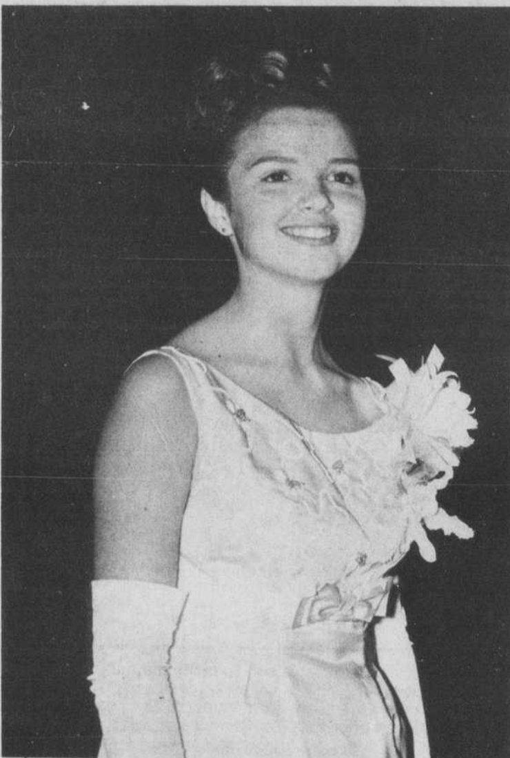
In Princess Contest