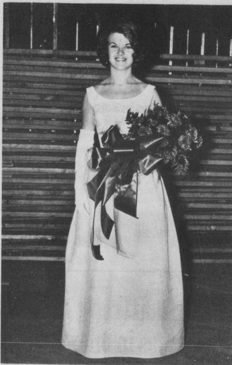
In Queen Contest

"The Showboat" has been shown on previous occasions this year, but May 14 marks the beginning of the nightly performances of the drama. The show held its premier last year and played to nearly 40,000 spectators.