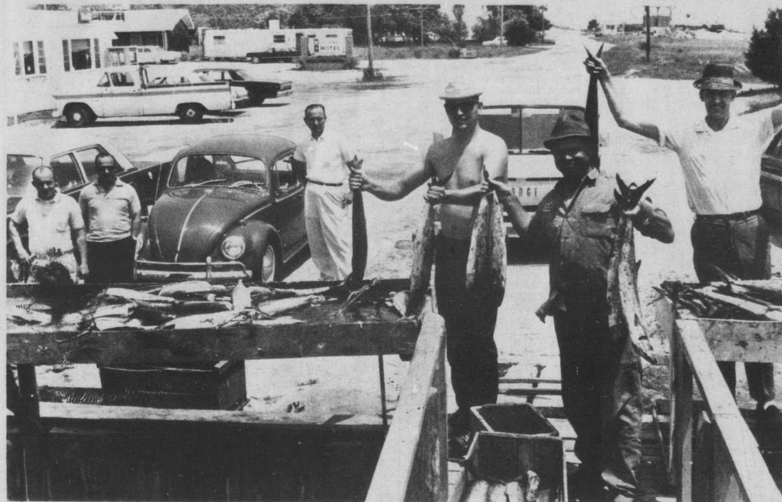
King Mackerel Bonanza Here This Week

RECORD—The biggest catches of king mackerel ever brought into Southport by charterboats were reported Monday when the lowest figure for the five boats fishing was 187. The top catch was 200—all of which is