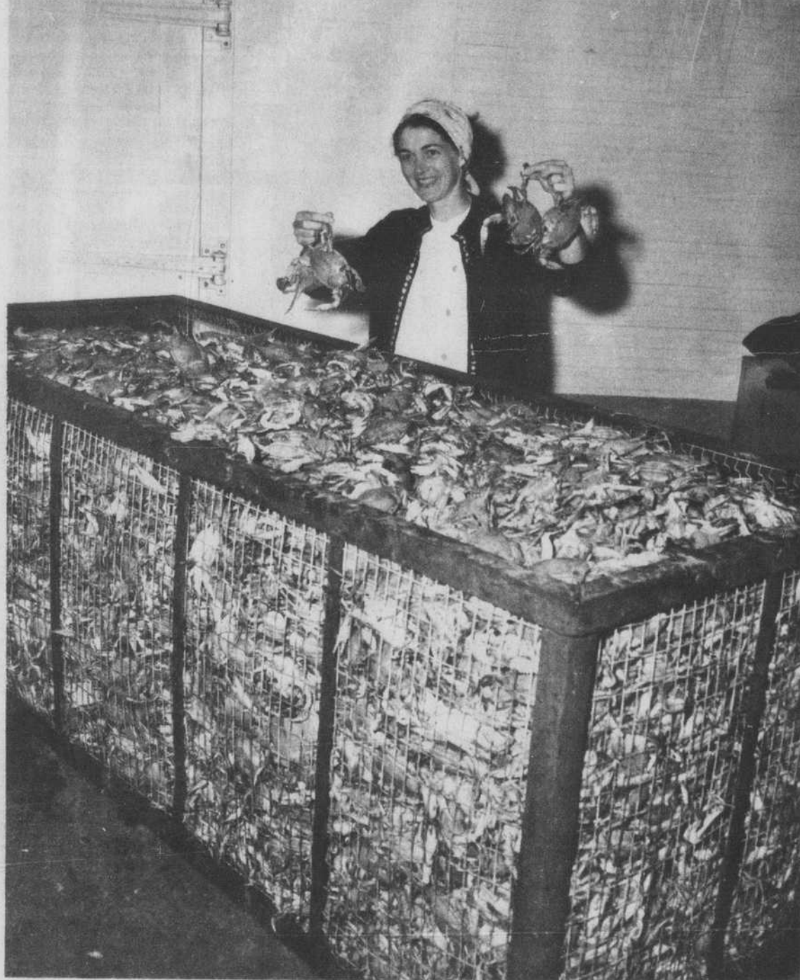
Plenty Of Crabs

READY — This huge basket holds 2,000-lbs of live crabs that are all washed and ready to go into the cooker at the Caroon Crab Plant at Southport.