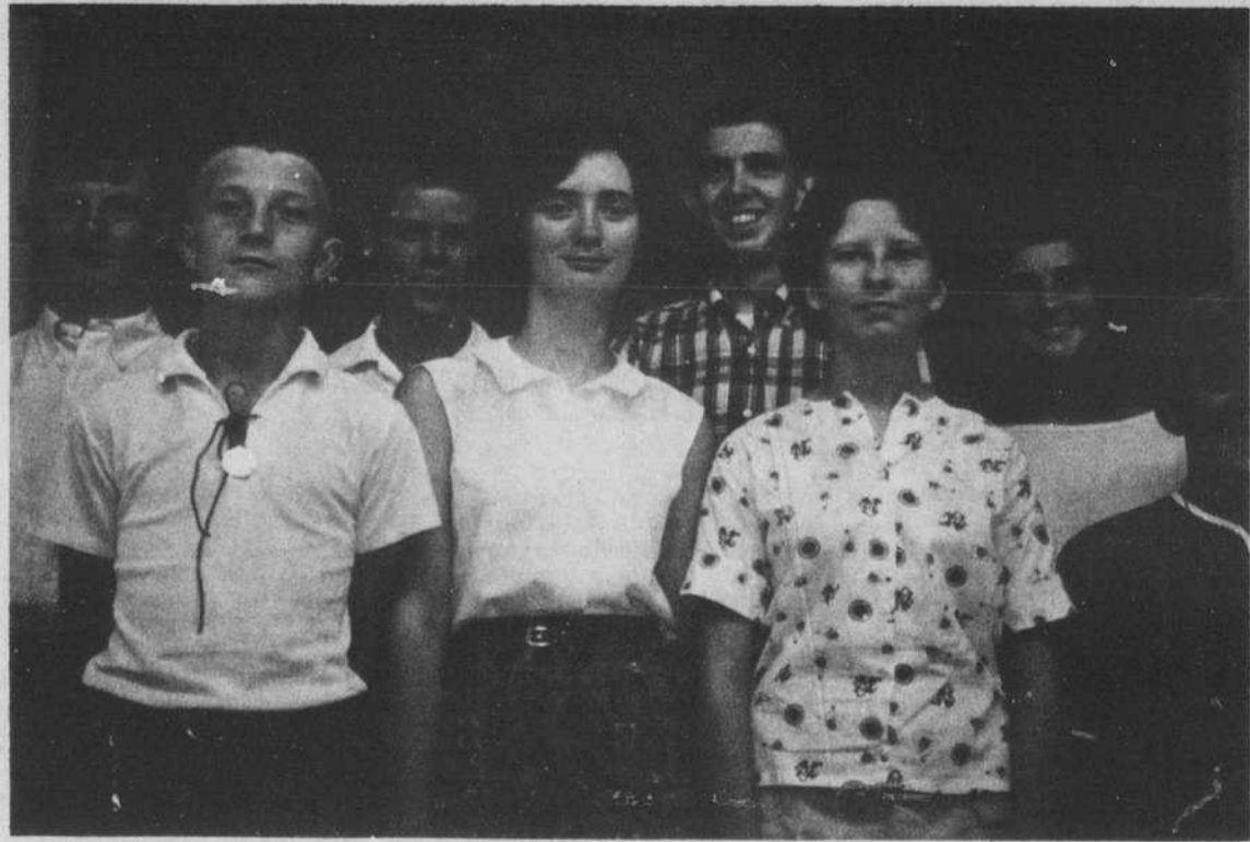
Attend 4-H Convention