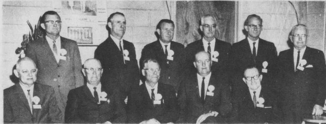
Leadership Of Brunswick REA

VOLUME 38 No. 20 12-Pages Today SOUTHPORT, N. C. WEDNESDAY, OCTOBER 26, 1966 5¢ A COPY PUBLISHED EVERY WEDNESDAY