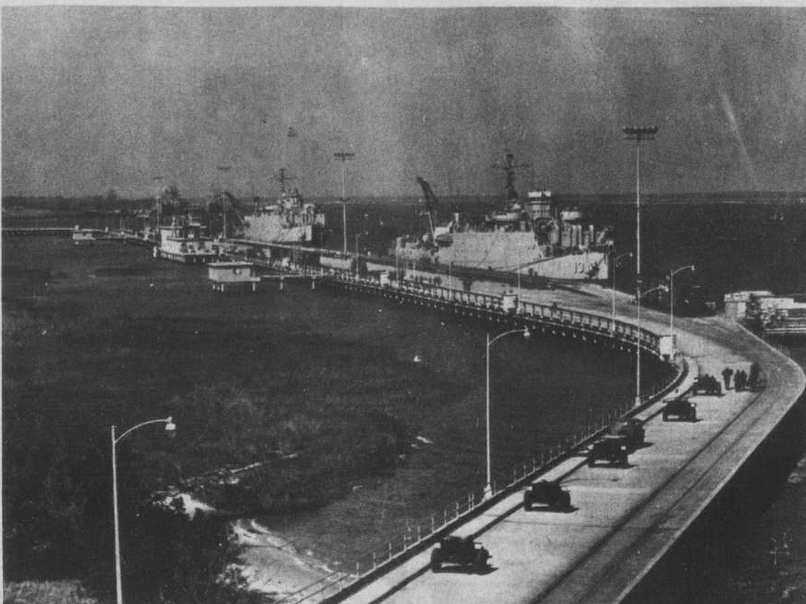
Activity At Sunny Point

BUSY — Four U. S. Navy vessels utilized in outloading the First Battalion Sixth Regiment, Camp LeJeune, are shown on berth at the Military Ocean Terminal, Sunny Point Friday. Personnel, supplies and equipment of the battalion were being outloaded for a several month tour of duty in the Mediterranean area.