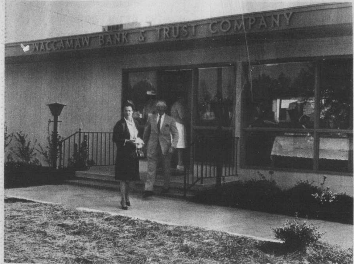
New Bank At Leland

OPENING — Formal opening of the new branch of the Waccamaw Bank & Trust Co. at Leland attracted a steady flow of visitors Sunday. A couple is shown above leaving the attractive new office, which has been erected to serve one of the most rapidly developing areas of Brunswick county.