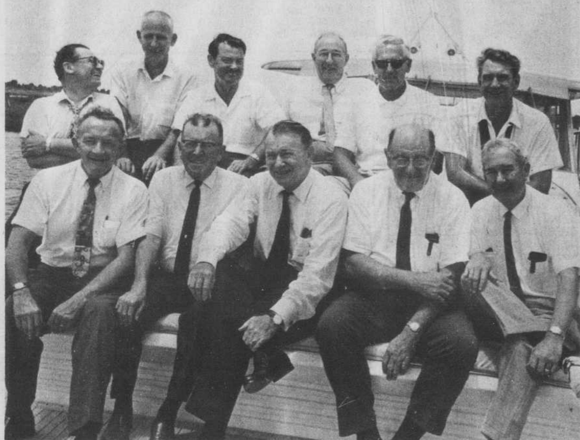
State Ports Authority Here