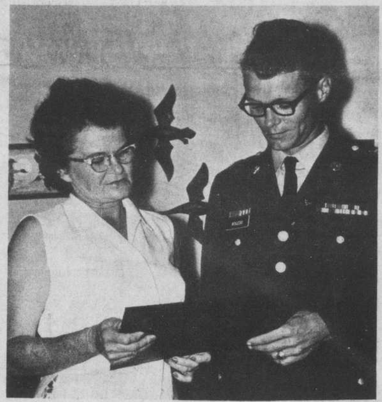
Southport Man Decorated