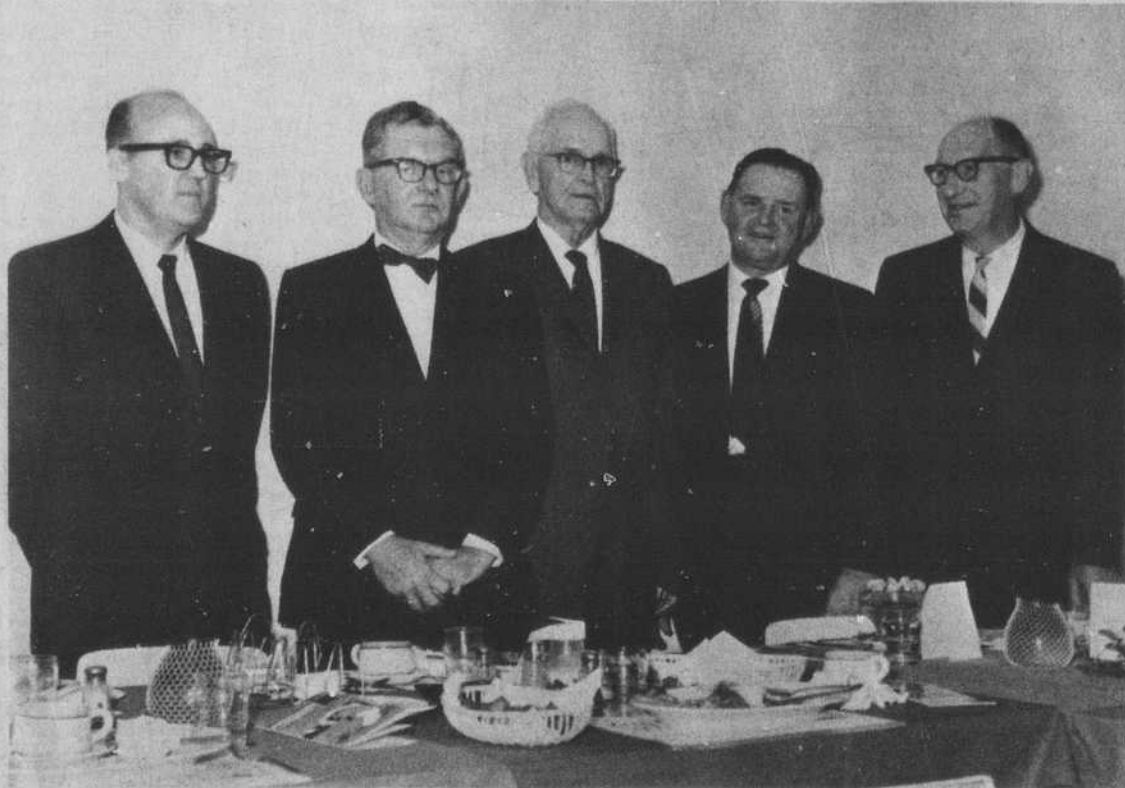
Bank Officials At Beach Meeting