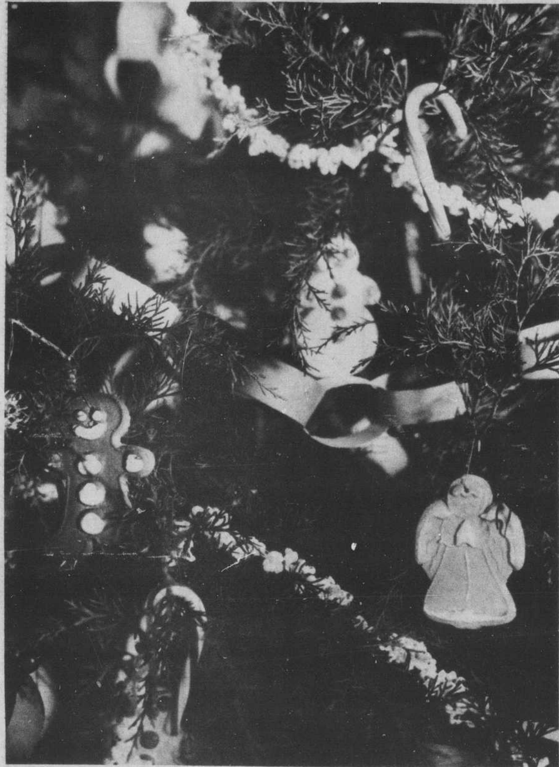
Old Fashioned Christmas Decorations

Gingerbread men, snowmen and angel cookies; strings of popcorn, cranberries and colored paper loops; pine cones and gum tree balls; handmade ornaments and candy canes decorate this colorful replica of a colonial Christmas tree on display in the visitors Center-Museum at Brunswick Town during this holiday season.