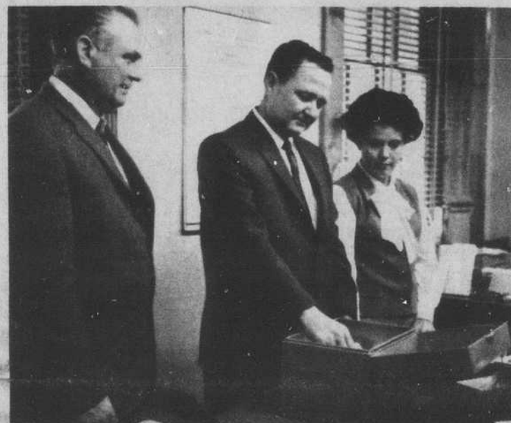
Draw New Jury List