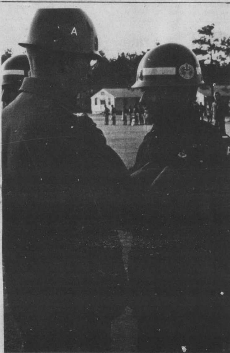
Receives Air Medal

Engage in the political arena (run qualified Negroes for public office and support the Negro candidate). Work for equal employment opportunities. Give children an education because "Illiteracy cannot walk beside education in an equal manner." Get children in best educational (Continued on Page 4)