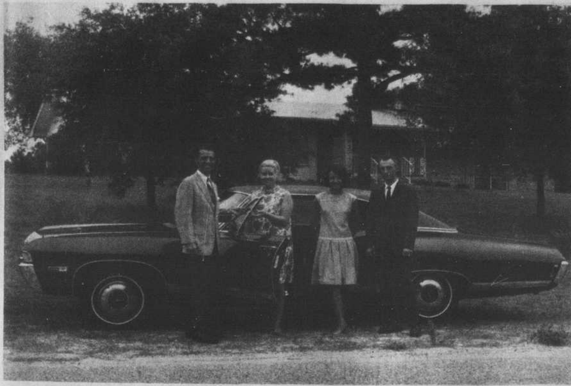
Ready For Departure