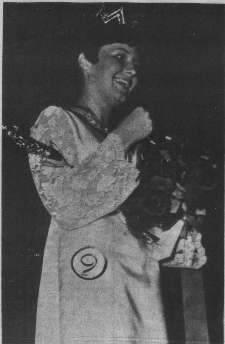
1968 Festival Queen