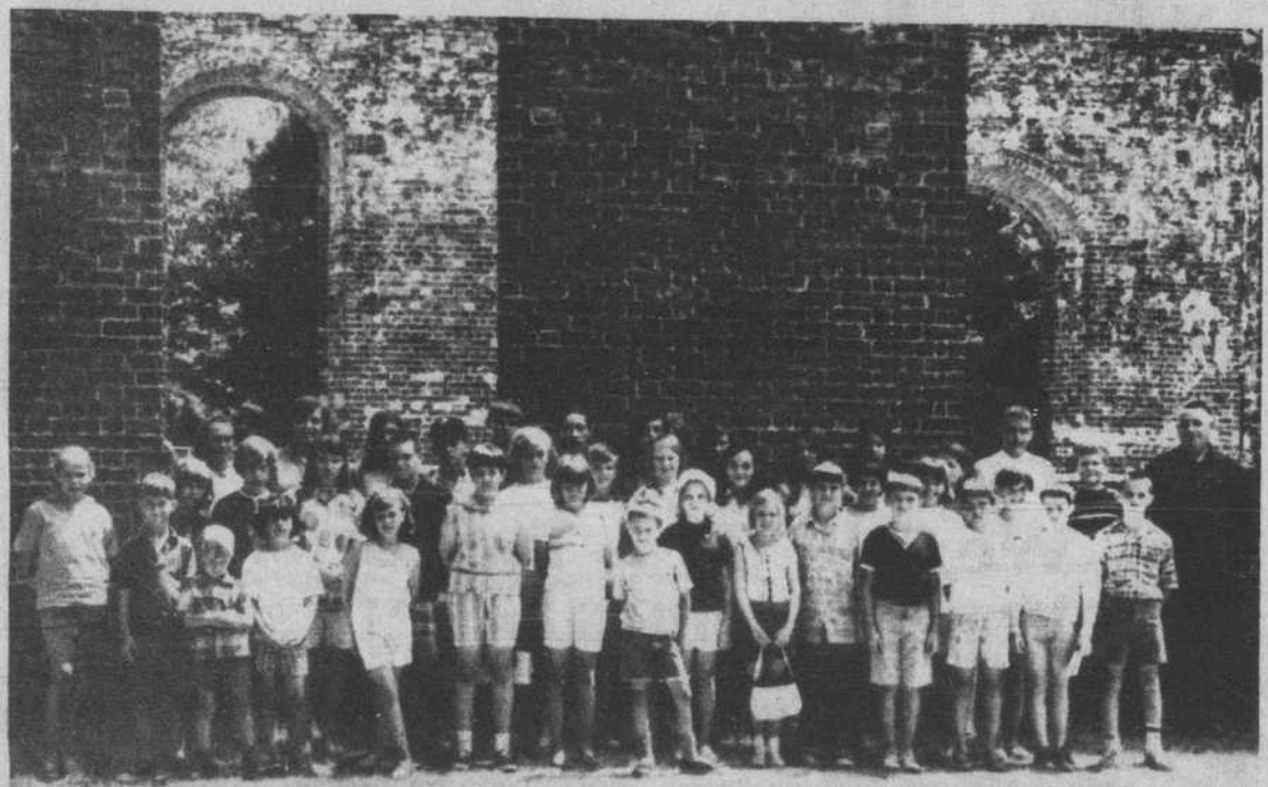
Outdoors Club Visits Brunswick Town

This is the new building of the Waccamaw Bank and Trust Co. at Bolivia, which will be open for business Monday. This will be the first banking service for this community which for a long time has been a center of automobile sales in Brunswick county.