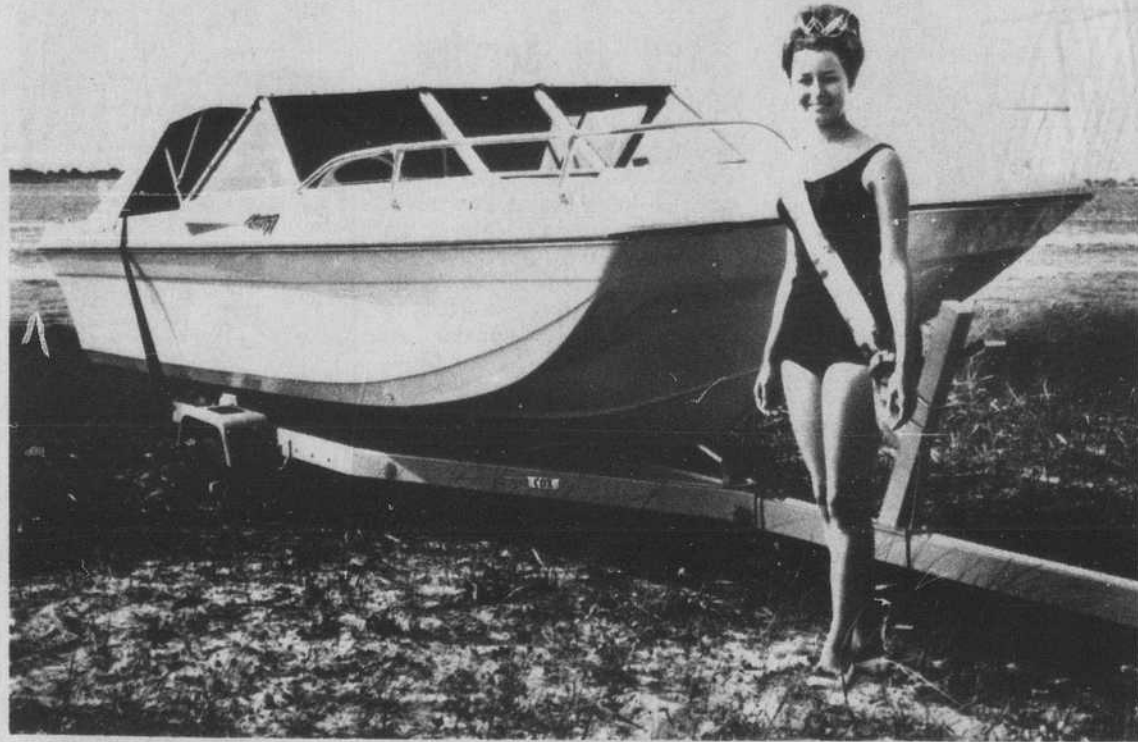
Miss Fourth Of July