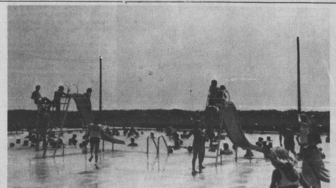
Everybody In The Pool

"We are very proud of Southport, and eager to show the sights to this man and the many artists arriving for this occasion," A club spokesman said this week. "We invite you all to join us in welcoming our guests on Independence Day. We will appreciate donations toward our purchase awards and any member of the club will be happy to accept your contribution. As you know, the paintings we buy are given to the city for all to enjoy."