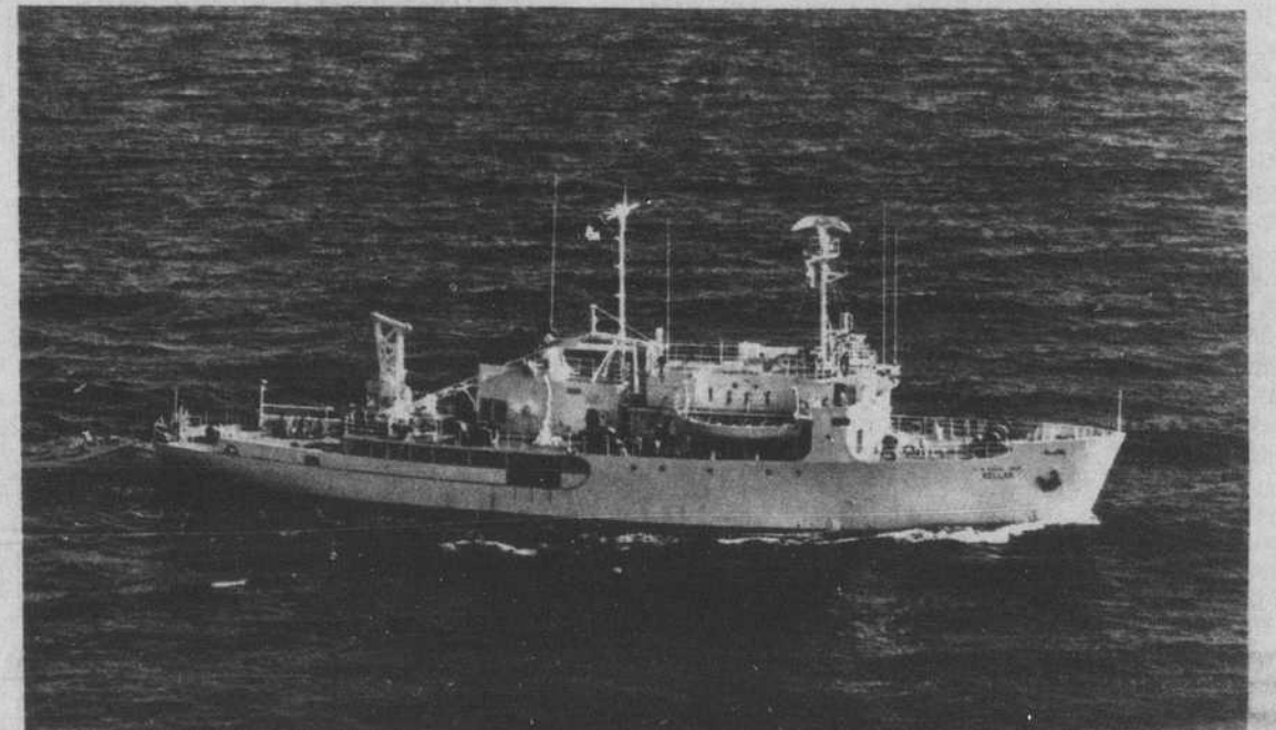
In Southport For Festival

Richard A. Waller is shown here as he emerges from the deck decompression chamber on April 15 following 20-hour decompression process concluding two months of continuous stay beneath the ocean's surface. He will be in Southport for the Fourth of July Festival with a scale model of his underwater habitat.