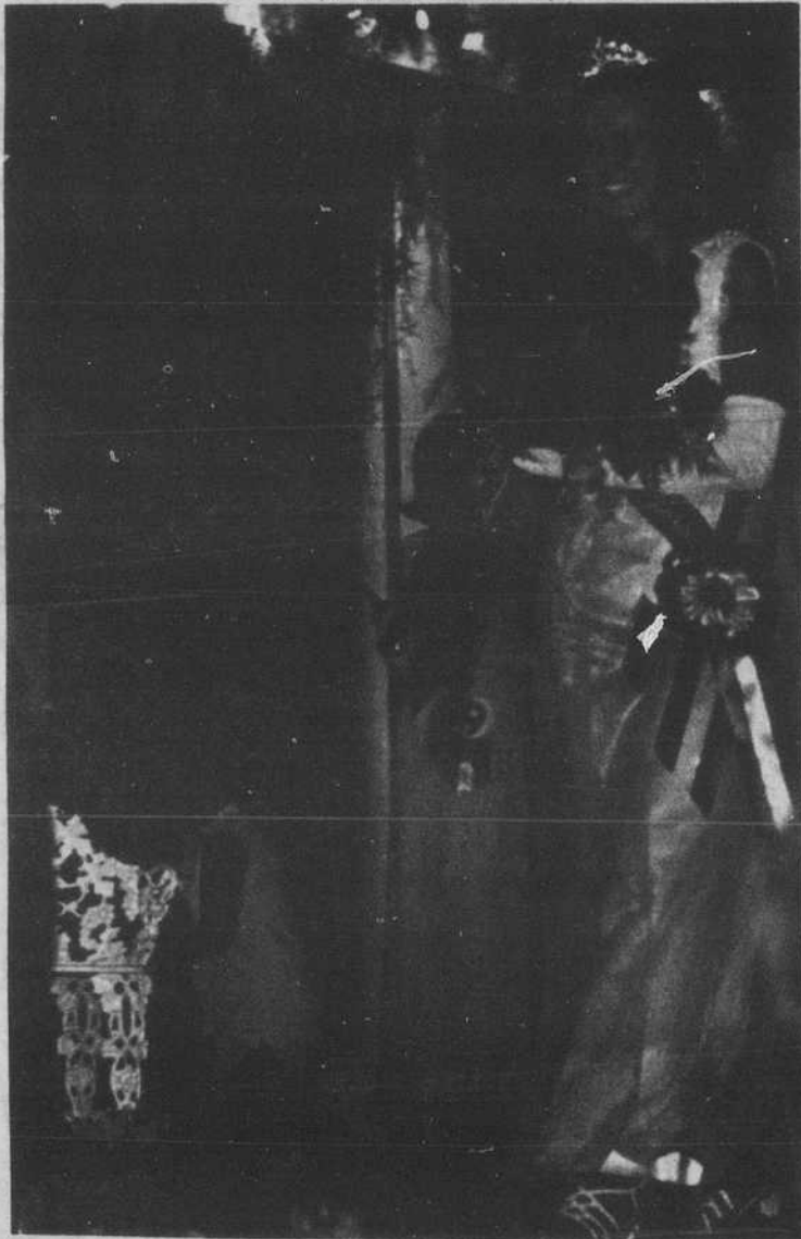
Miss Fourth Of July

SELECTIVE SERVICE The office of Local Board No. 10, Southport, will be closed from July 4 until July 14. The Induction Call for Brunswick County is scheduled for July 29 for 7 men. The AFPE Call for Brunswick County is also scheduled for July 29 for 31 men. Selected registrants will be notified this week.