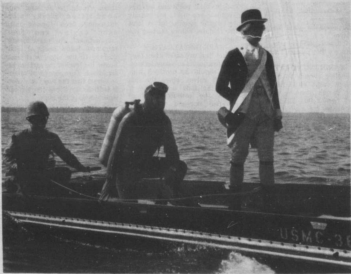
Patriotic Film Preview Friday

"The Birthplace of Liberty", that is the description given Brunswick Town, which is the setting for the patriotic color film, "The Incredible Star Spangled Banner". This film, recently completed by the staff at Cape Fear Technical Institute, in cooperation with the U. S. Marine Corps, will have its premier showing at Southport Friday evening of this week as a feature of the Fourth of July Festival. This photograph, showing combatants of the past, present and future, was taken in the waters of the Cape Fear River offshore from this historic site of early colonial settlement.