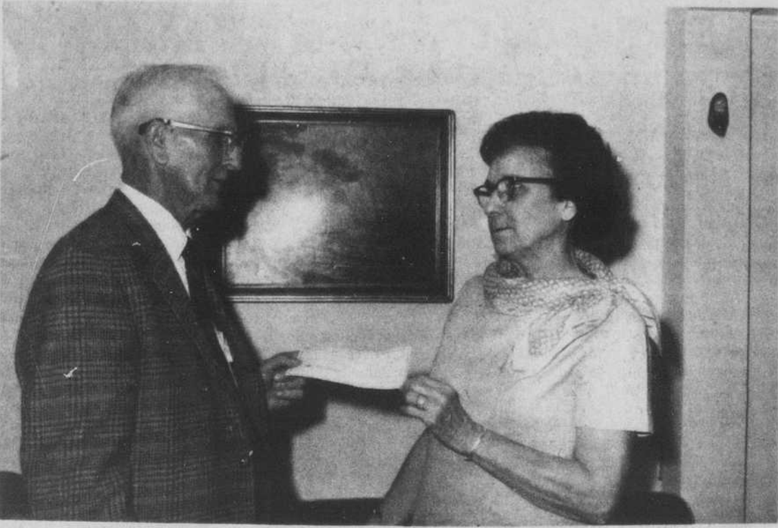
Check From Supply Lions