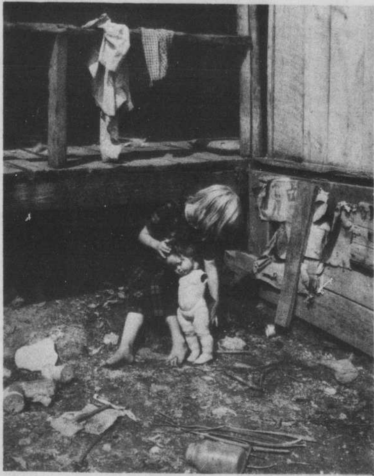
Situation in '66; has her plight improved?

The staff of Sencland Community Action, Inc.,