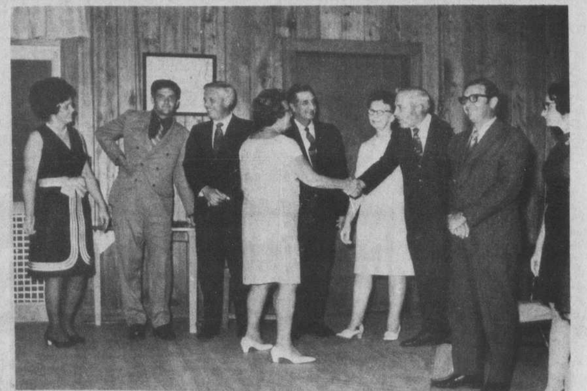
Brunswick County Visitors