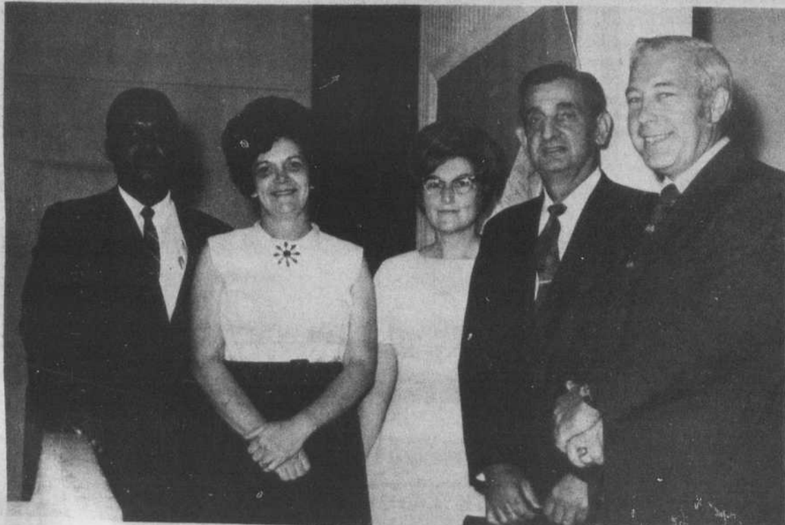
Attend Board Meeting