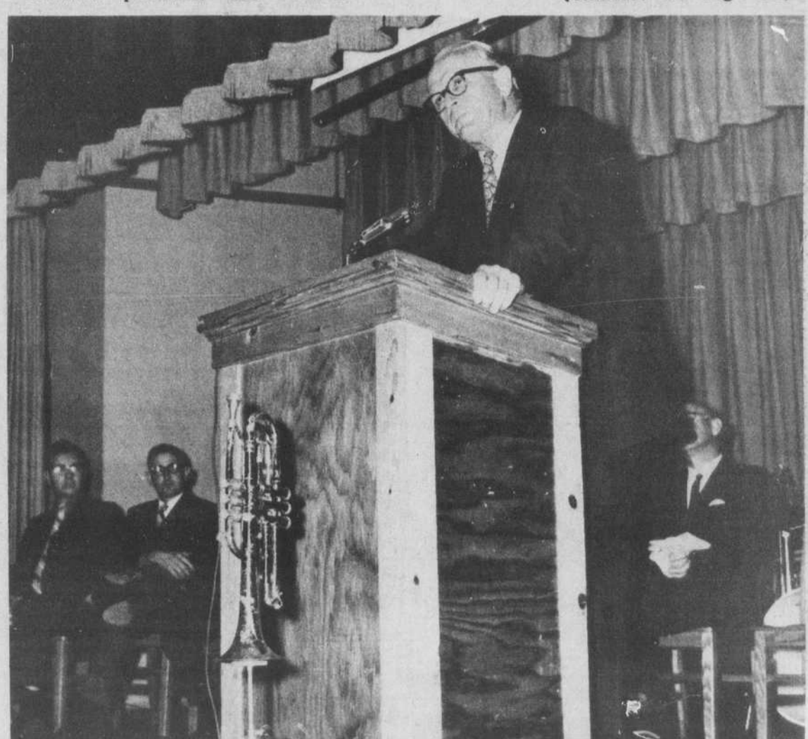
Speaker At Telephone Meeting

Admission price for spectators is $1 for adults and 50 cents for children under 13. All the proceeds from the show will be used by the Southport Jaycees for community development and improvement.