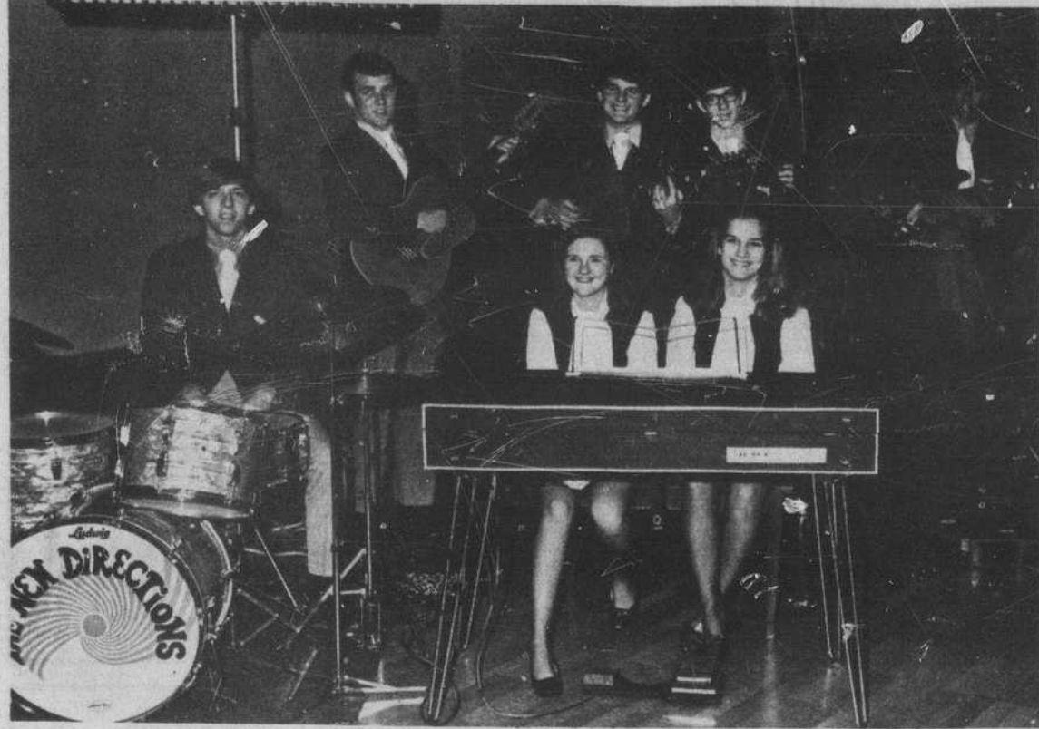
Appear In Sunday Concert

The instrumental section of the New Directions will give an afternoon Concert of contemporary music at the auditorium at the Baptist Assembly Sunday afternoon.