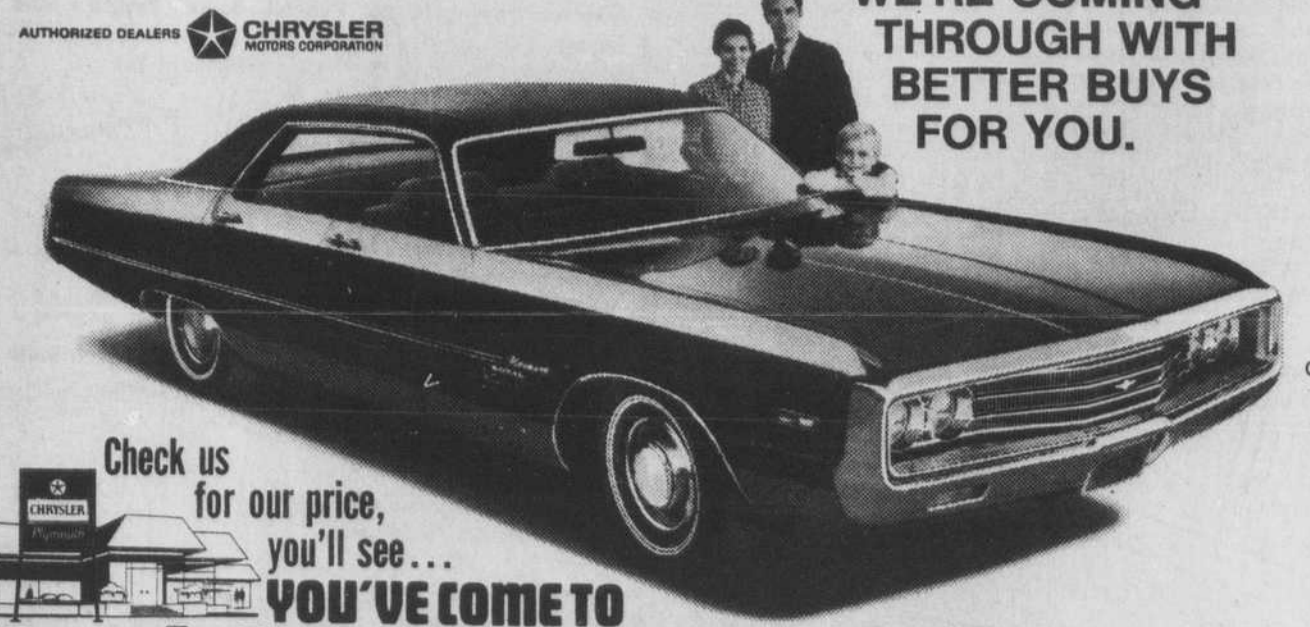
Chrysler Royal 4-Door Hardtop

WE'RE COMING THROUGH WITH BETTER BUYS FOR YOU.