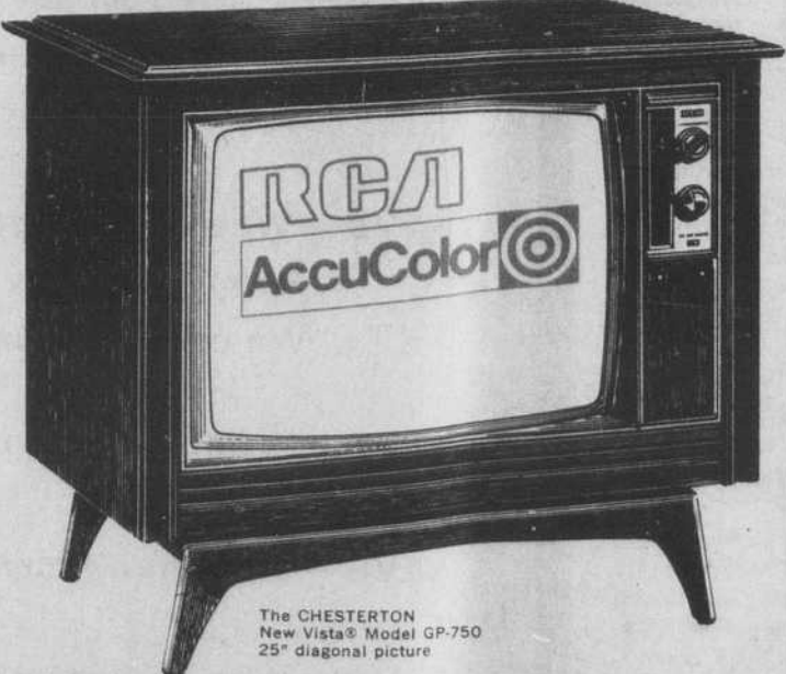
The CHESTERTON New Vista® Model GP-750 25" diagonal picture

Model for model, dollar for dollar, RCA AccuColor is your best Color TV buy. Gives you the performance, the convenience features and the built-in dependability you want. And now, during AccuColor Action Days—take your choice of styles in values that are greater than ever.