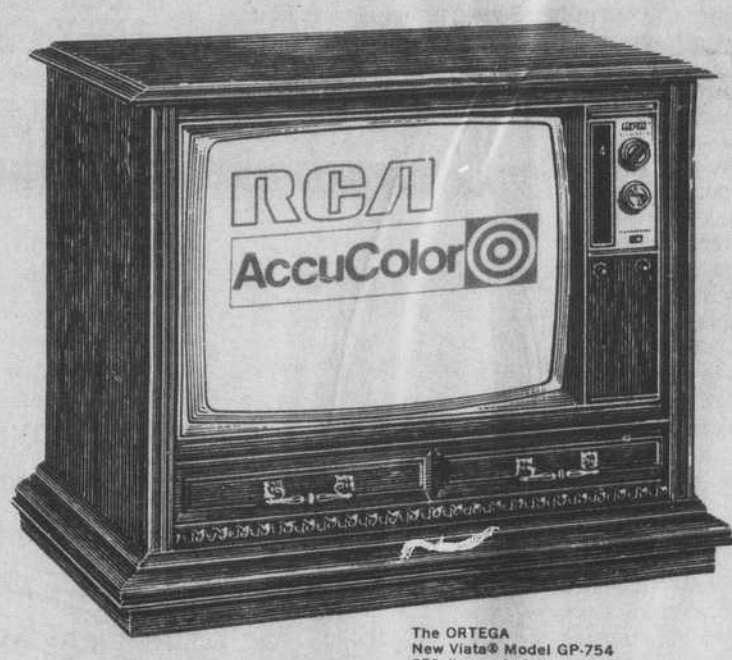
The ORTEGA New Vista® Model GP-754 25" diagonal picture