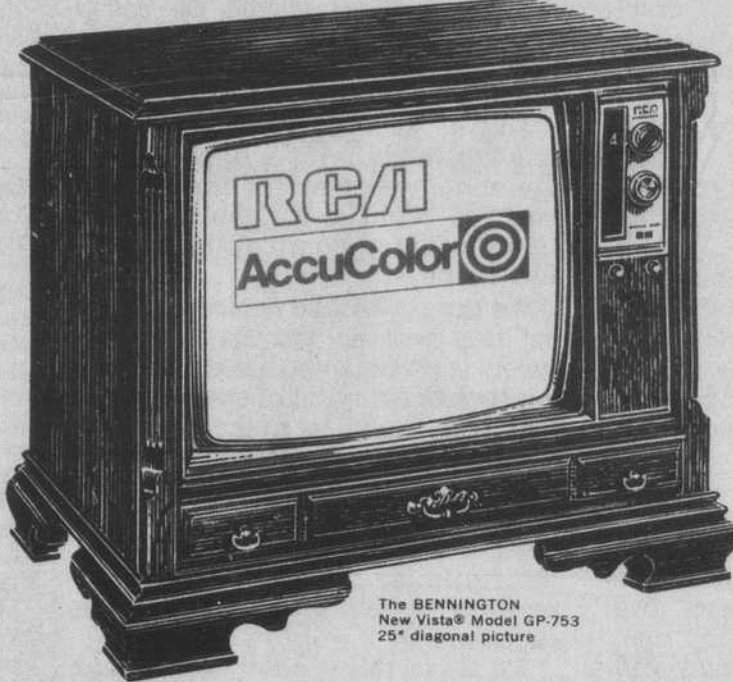
The BENNINGTON New Vista® Model GP-753 25" diagonal picture