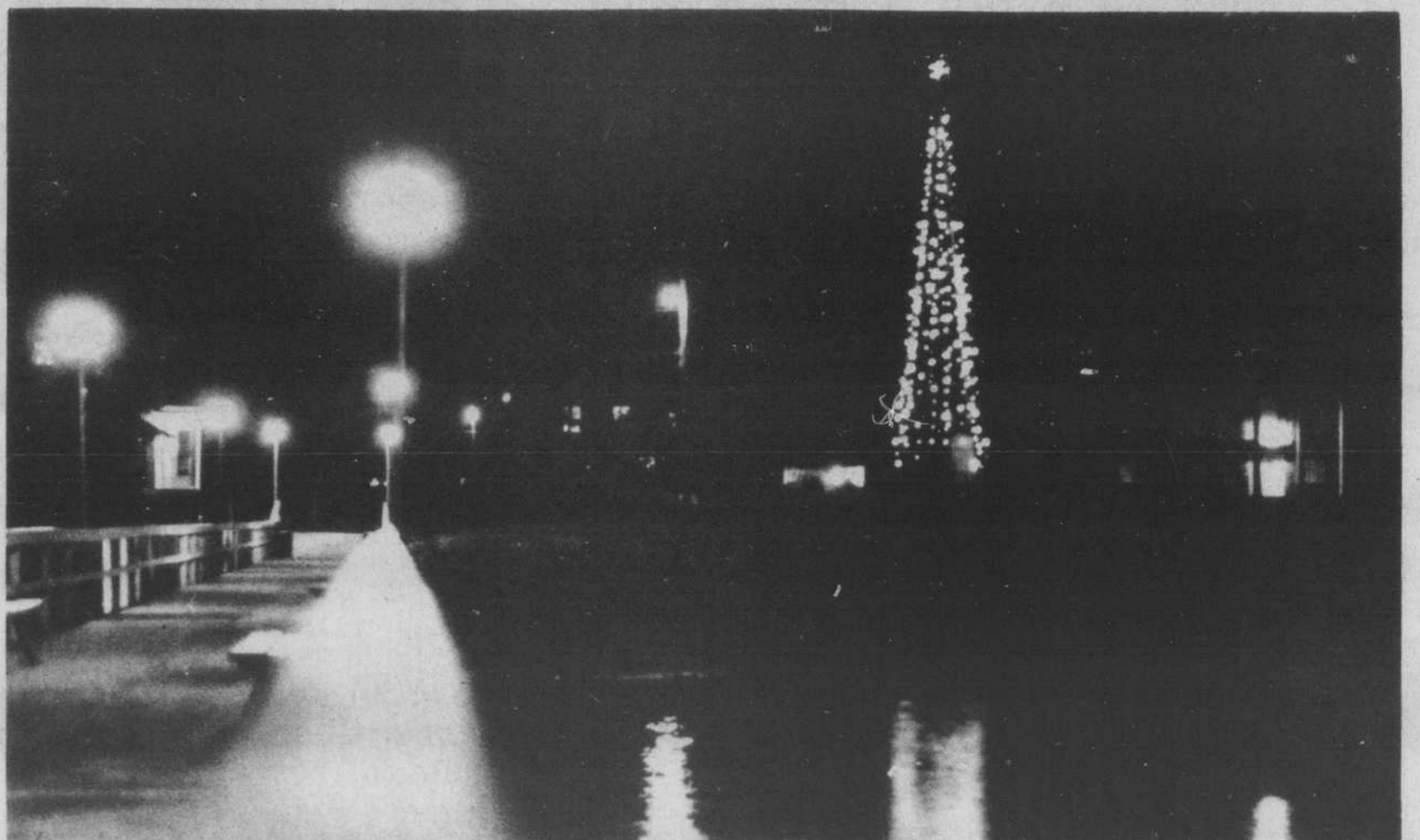
THE TALLEST, STRAIGHTEST Christmas "tree" in Southport is located on the waterfront and is not a living tree at all. It is the weather tower, the spire of which makes a perfect base for the multi-colored lights. The "tree", shown here as part of a