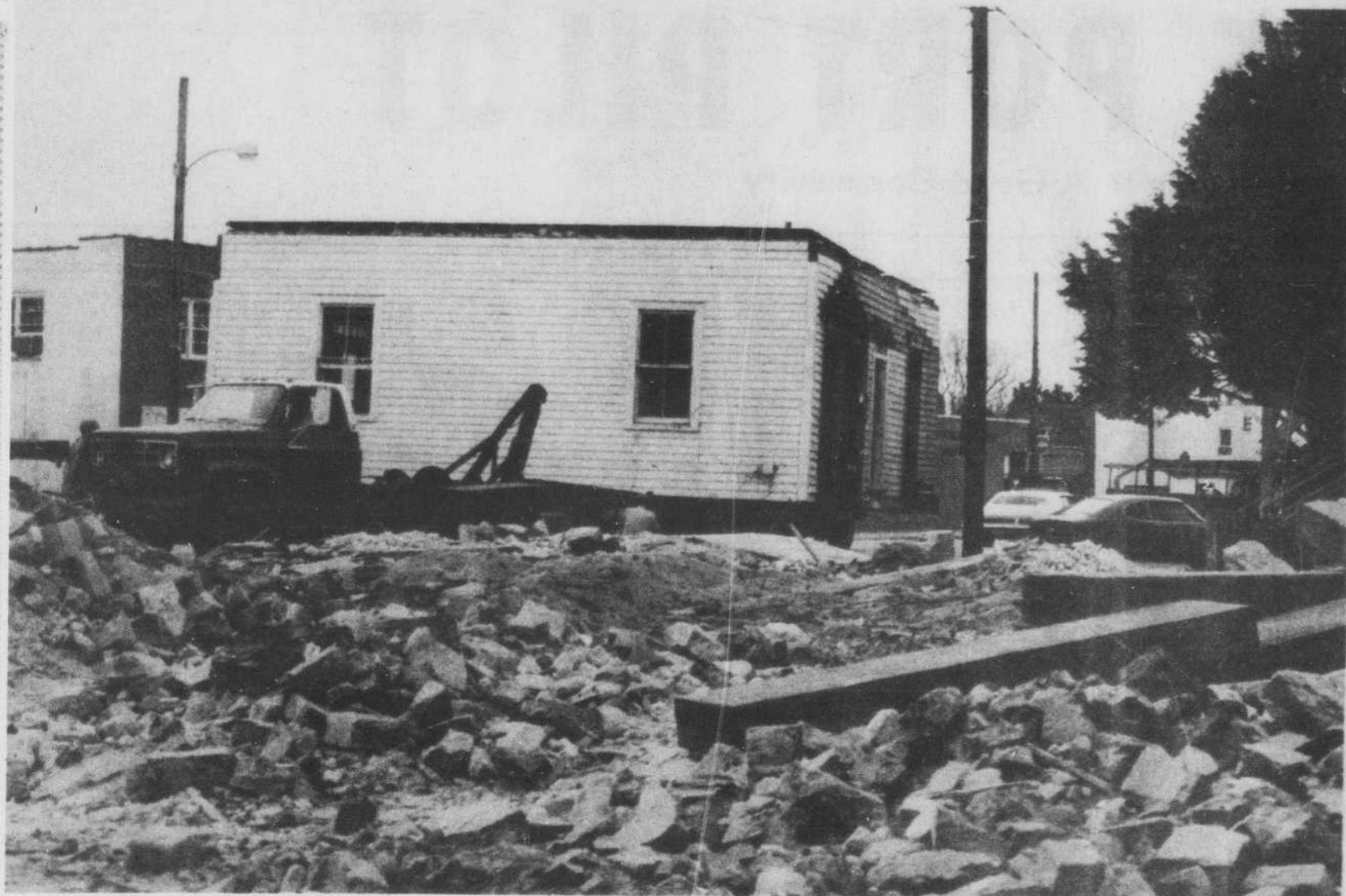
A STRUCTURE BEARING little resemblance to the old Watson home was moved from the site this week, making room for a new Peoples Savings and Loan Association building on the corner of Howe and Nash streets. The upper floor and porches were removed from the Watson house, allowing the remainder to be moved to another part of town. The old home reportedly will be restored.