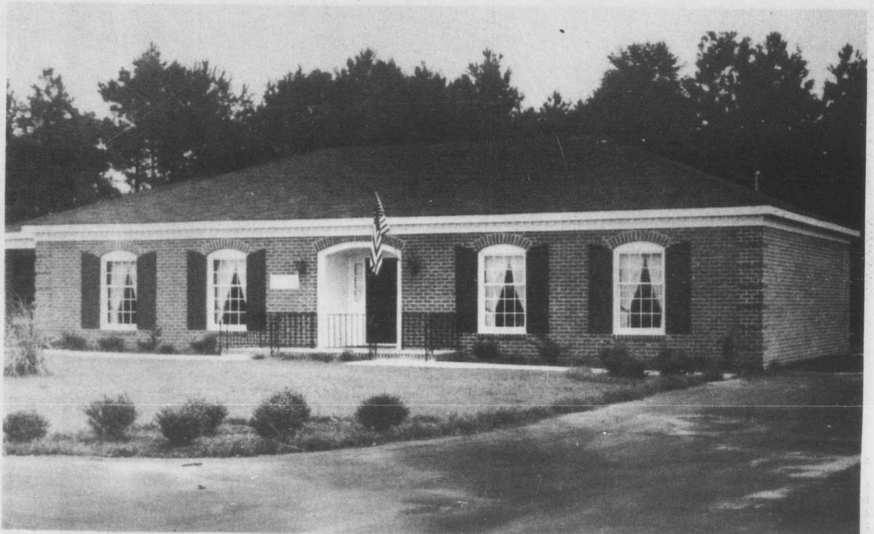
THE NEW OFFICE of Security Savings and Loan Association in Leland is being officially opened this week. The institution, located on US 74 - 76 in the rapidly - expanding