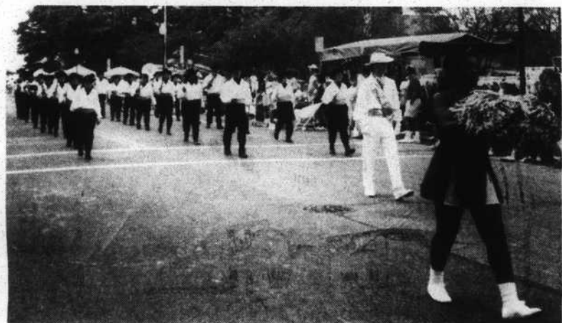
Members of the South Brunswick High School Marching Band showed off their musical talents when they performed in the 45th Azalea Festival parade in Wilmington.

Third graders learned about measuring and estimating meters and kilometers by competing in six metric "Math Olympics" activities. Students sailed paper airplanes through the air to estimate how far their planes would fly, then measured with a meter stick to see if their predictions were correct.