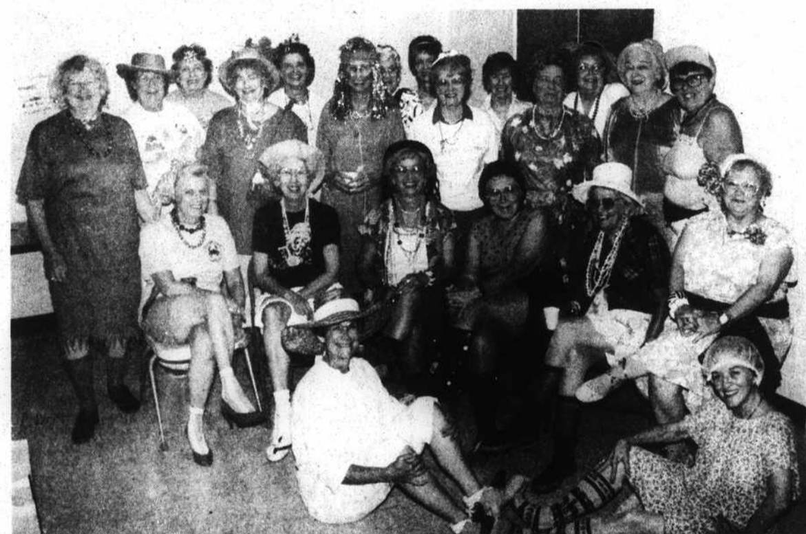
The usually dignified members of the Southport Woman's Club did an unusual bit of fund-raising, culminating with a "Tacky Party" last week. Each month for three months members purchased sealed bags containing items for the head, the body and the feet. For the June meeting they put their mismatched outfits together and shared laughs inspecting everyone's "tacky" outfits.