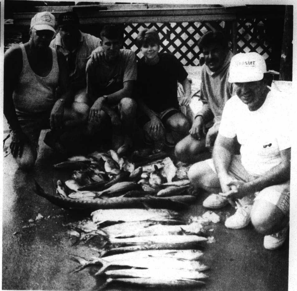
Small kings and big beeliners -- plus a really big barracuda -- were the features of this catch aboard the Kingfisher last week. Kings also resurfaced for Oak Island pier anglers over the weekend.

Over 50 percent of The State Port Pilot is printed on recycled paper.