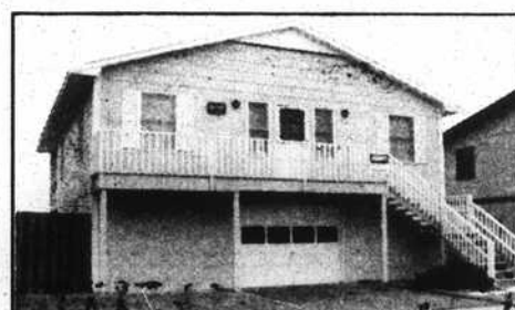
2923 E. BEACH DRIVE

"Long Leaf Retreat" -- two for the price of one! This oceanfront duplex features 2 bedrooms up and 2 bedrooms down. Outstanding rental history. $140,000.