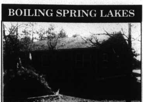
BOILING SPRING LAKES

1080 MOREHEAD. Desirable lakefront home with nine rooms. 3 bedrooms, 1 bath, move-in condition. Great view of Lake Hastie in Boiling Spring Lakes. Priced just right, $79,900.