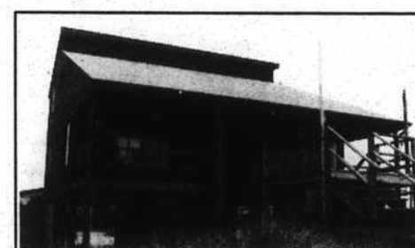
1623 E. BEACH DRIVE

"Savannah" -- newly renovated, fully furnished and exceptionally nice! Oceanfront cottage with 4 bedrooms, 2 baths, sun deck and garage. Don't miss the opportunity. $119,000.