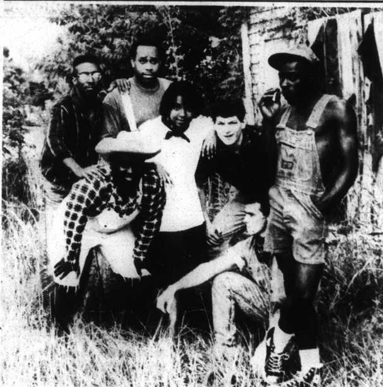
"Cotton Patch Gospel" is Tapestry Theatre Company's third production of the 1992 season. Set in rural Georgia, it is the musical version of "The Greatest Story Ever Told" and is based on the book "The Cotton Patch Version of Matthew and John". Performances will be July 15-19, 22-26, 29-31 and August 1 at the Studio Theatre in Thalian Hall, Wilmington. Reservations can be made by calling 763-3398.

Tickets for all performances are $10 in advance and $12 the day of the performance.