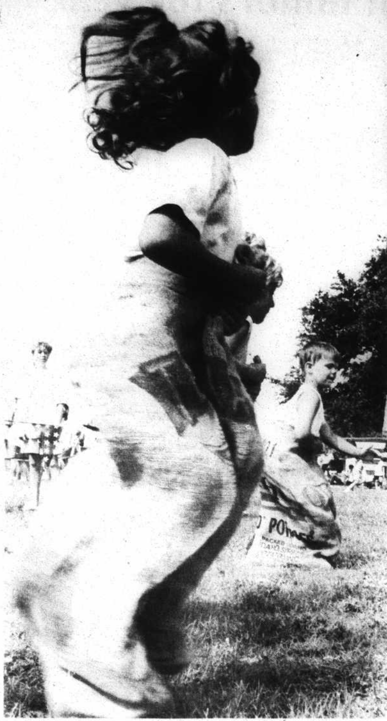
Hippity-hopping down the competition trail, these youngsters had a good time at the children's field events on the Garrison on Friday. They could also participate in egg-totes and wheelbarrow races.