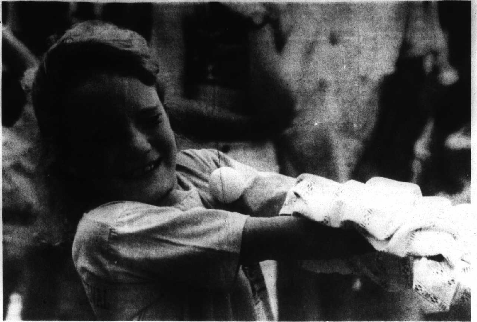
This young lady is about to be surprised in her attempt at catching a raw egg during the children's field events on Friday. Various competitions were offered for youngsters of all ages, then they were treated to abundant helpings of watermelon.