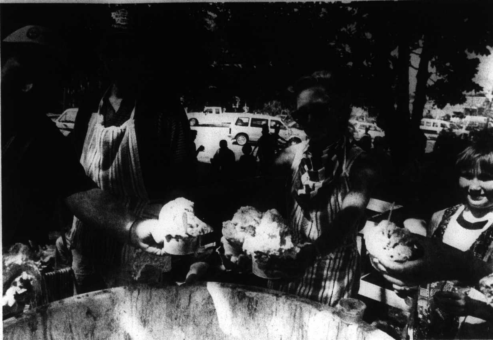
Saturday's (world's largest ice cream) sundae was served in a more sanitary fashion than in the good ol' days, but always the helpings came up plentiful, and with a great big smile. The shade beside the Fourth of July headquarters building helped festival visitors enjoy the treat.

workers. Coring is the son of Charlotte Cochran and Bill Coring of Southport.