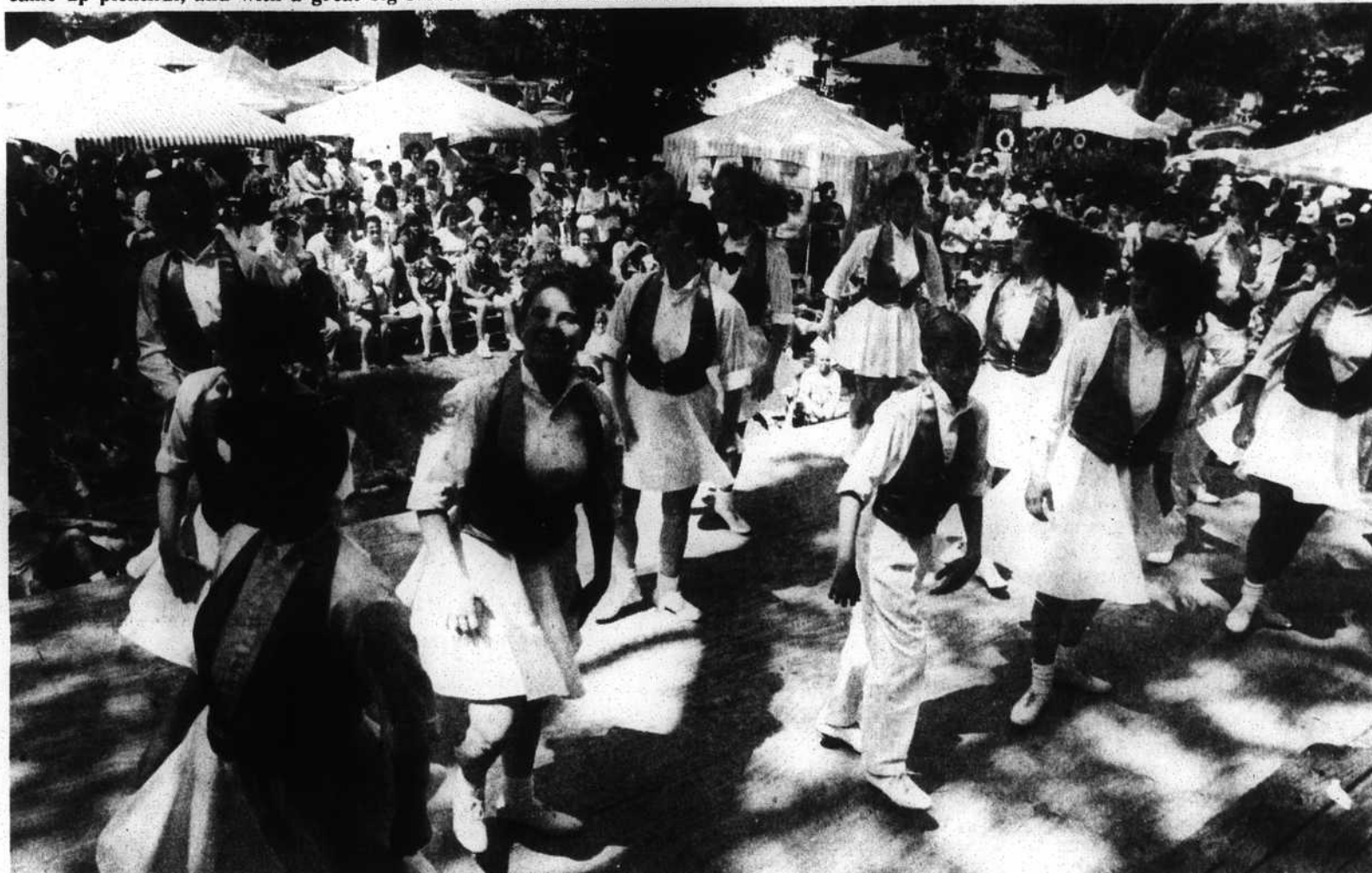
There was a good time both on stage and off Friday and Saturday as the Old Dock cloggers entertained in Franklin Square Park. Visitors there could enjoy the stage show, browse among the arts and crafts exhibits or visit Franklin Square Gallery.