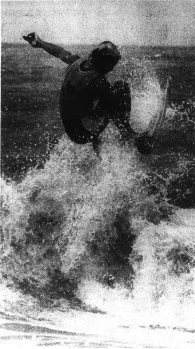
The surf was up, up, up on Thursday as hundreds of participants turned out for surfing competition or surfing spectating at the Long Beach cabana during Beach Day.