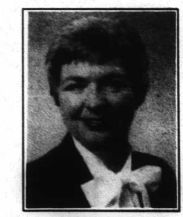
JERRY MILLS $970,600 Closed Transaction Volumne 1/1/92 - 6/30/92

VERILYN McKEE $974,650 Closed Transaction Volumne 1/1/92 - 6/30/92