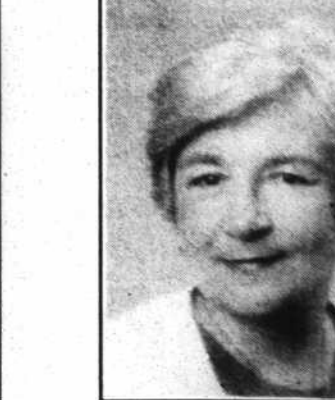
DOT SCHUCK $2,015,300 Closed Transaction Volume 1/1/92 - 6/30/92

MARGARET RUDD $1,912,400 Closed Transaction Volume 1/1/92 - 6/30/92