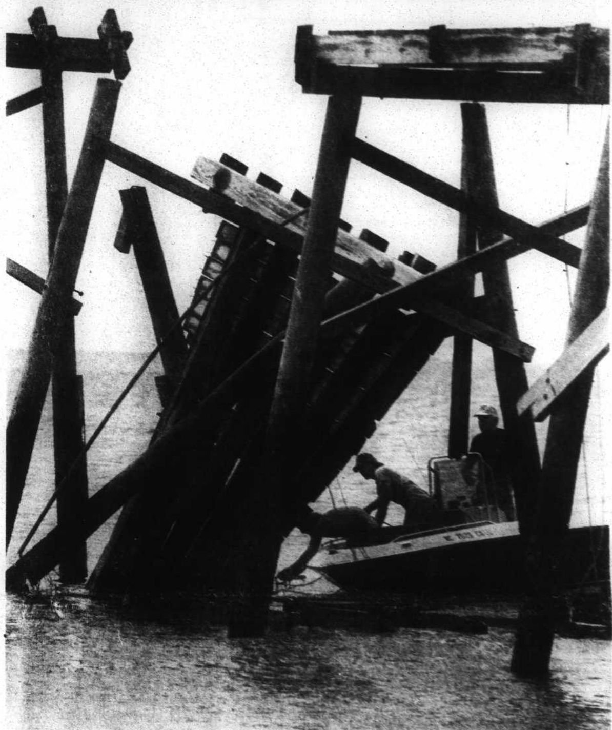
Workers have been dropping sections of the Yaupon pier into the surf and dismantling them ashore. Demolition should be complete this week. Construction of a new pier is planned by spring.