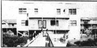
OCEANFRONT 5-bedroom home with 4 full baths. Great rental history and in a terrific location for year round living. Fabulous views and numerous amenities. 303 Ocean Drive, Yaupon Beach.