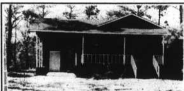
PRICE REDUCED on this 3-bedroom brick and frame home with carport, outside storage, front porch, 1 1/2 baths, plus additional shower inside! This is a must see at only $54,900.

LOTS Yaupon Beach from $16,000. Long Beach wooded lots from $8,250 Second row Long Beach, $38,900 Canal with tank from $30,900 Second row Caswell from $66,000 Lots & Land Winnabow area Commercial, Yaupon & Long Beaches