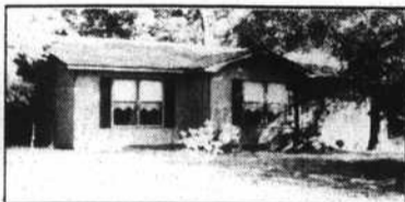
2-BEDROOM, 2-bath home situated on 2 LOTS with screened porch, Florida room, skylight, built-in planter and so much more! Located on quiet street. Call today. $74,000.