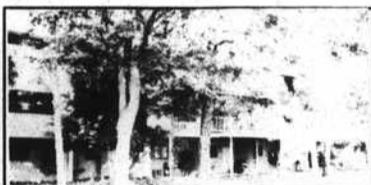
CASWELL DUNES , 3-bedroom, 2-bath unit with garage on golf course (Bunker). Most furnishings included at $98,500.