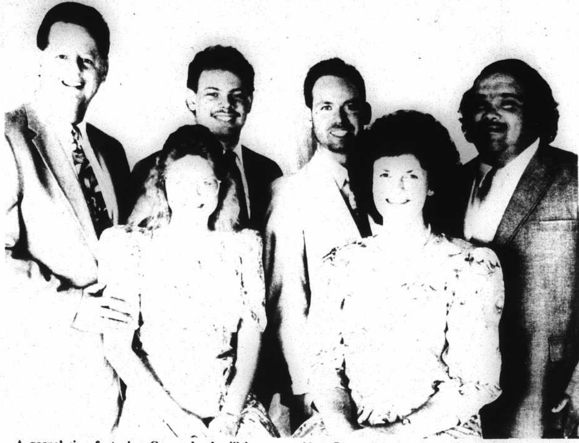
A gospel sing featuring Canaanland will be presented at Mill Creek Baptist Church on November 29 at 7 p.m. The church is located on Highway 87 near Winnabow. A love offering will be taken.