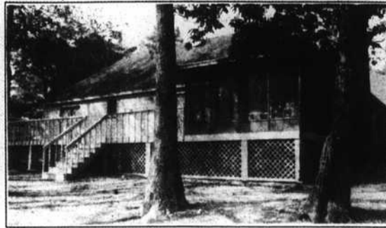
39 AUGUSTA DRIVE. 3-bedroom, 2 1/2-bath overlooking 14th fairway and fresh water lagoon. Convenient floor plan with french doors, fireplace, garage, sprinkler system and more! $139,000.