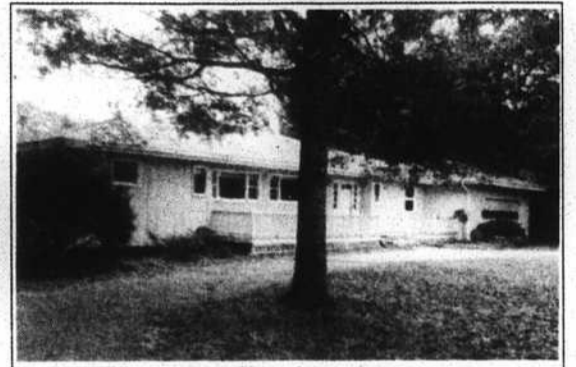
4 OAK ISLAND DRIVE. Immaculate 4-bedroom, 2-bath home has spacious great room with cathedral ceiling and lots of windows, garage and pool! $149,500.