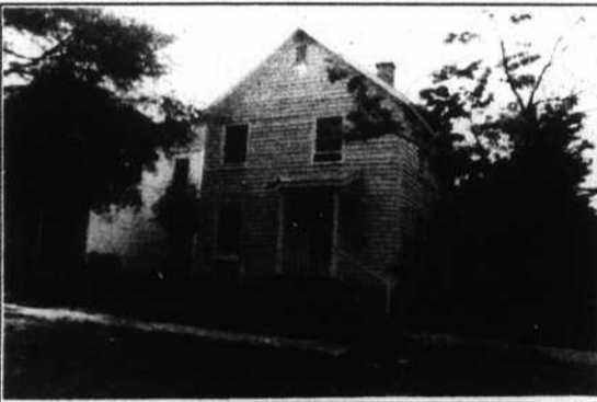
402 W. WEST STREET. The striking interior of this appealing cottage will surprise and delight you! Extensively remodeled in 1986, it is ready to move in and enjoy. $103,000.