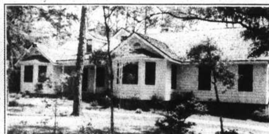
119 FLOWERING BRIDGE PATH. Beautiful, spacious home with 3 bedrooms, 2 1/2 baths, cathedral ceiling, fireplace and hardwood floors in great room. Unmatched master suite with jacuzzi and sunroom. Two-car garage. The list is endless. $192,000.