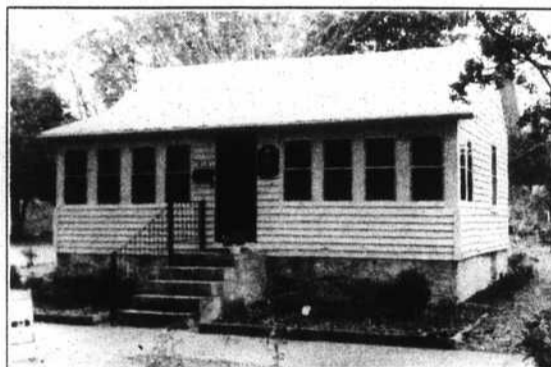
310 E. NASH STREET. The perfect cottage to live in and explore historic Southport. Located on a tree-lined street near the old jail and cemetery, this 2-bedroom home is in move-in condition. $69,900.