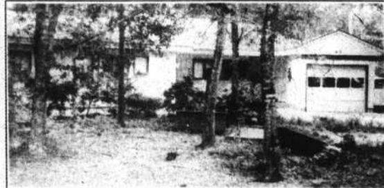
43 AUGUSTA DRIVE. Great location on high shaded landscaped lot overlooking pond on 114th fairway of Oak Island Estates Golf Course. $108,900.