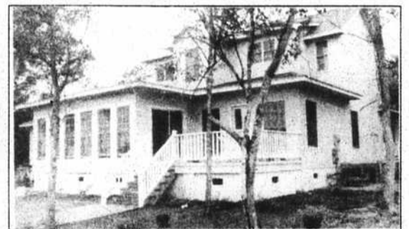
211 NARCISSEUS MEWS. 3-bedroom, 2 1/2-bath, spacious new construction overlooking the golf course. Beautiful low country design with many extras, including spacious walk-in closets, lots of cabinets, disposal, and more. $219,000.