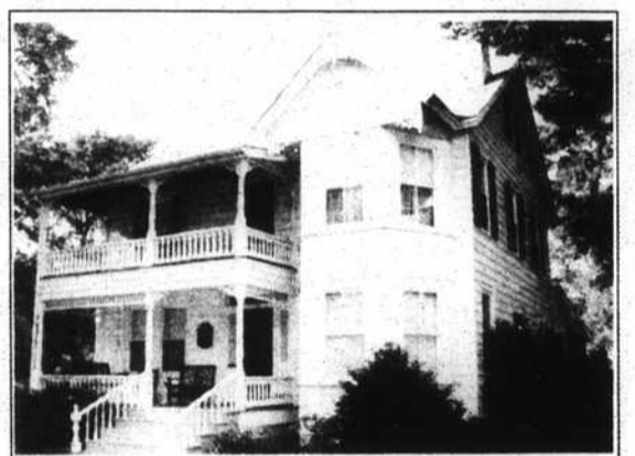
120 W. MOORE STREET. This 5-bedroom, 4 1/2-bath home, formerly used as a bed and breakfast inn is close to downtown amenities and has a view of the river. $285,000.