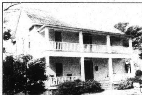
119 N. ATLANTIC AVENUE. An excellent mixture of the old and the new in this very large, restored historic home. With your own touches, it can be spectacular! $189,500.