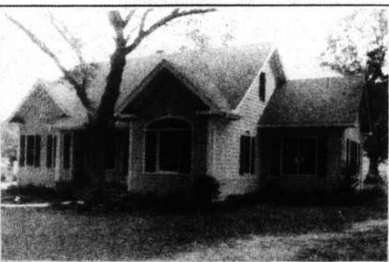
LOT 5. Enjoy downtown living in a gracious new 3-bedroom, 2 1/2-bath home with a view of the Cape Fear River. 1 1/2-story with lower level master bedroom, formal living and dining rooms, and garage. $198,500.