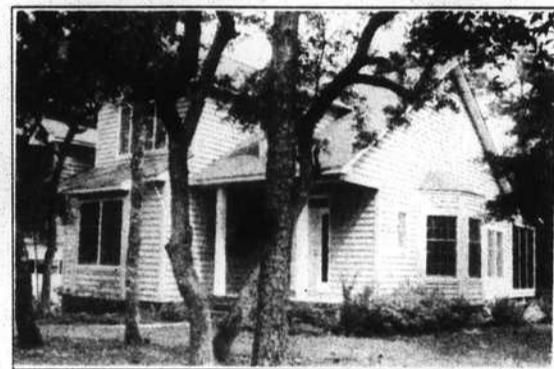
732 ALYSSUM AVENUE. Like new 3-bedroom, 2 1/2-bath home ready to move in and enjoy. Many extras including jacuzzi in master bath, vaulted ceilings, formal dining room, double fireplace, and more. $155,000.