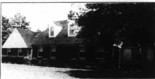
7 QUAIL HOLLOW DRIVE. Spectacular space inside and out! 4- or 5-bedroom, 3-bath home has extra large rooms, double garage, beautiful landscaping, and much more! $174,500.