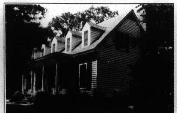
6035 SPIKERUSH TRAIL. Stately 3-bedroom, 2 1/2-bath home of excellent quality construction with tremendous appeal. Family room/den with fireplace and wet bar, 18x14' screened porch, formal dining room, paved drive to attached double garage. $186,000.