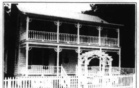
301 E. WEST STREET. Circa 1870s Victorian 3-bedroom, 2 1/2-bath home has been authentically restored with many custom antique features. Beautiful! $162,500.