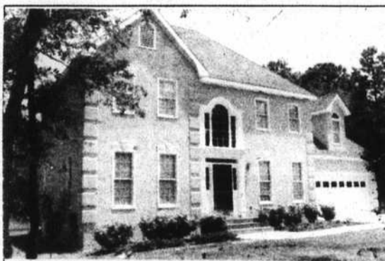
728 ALYSSUM AVENUE. Enjoy luxurious living in this 4-bedroom, 3-bath English Manor home with marshfront view. Many extra features including double garage, tray ceilings, hardwood floors and more! $189,000.