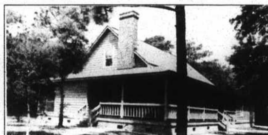
704 ALYSSUM AVENUE. New 3-bedroom, 2 1/2-bath home with screened porch to enjoy the beautiful corner lot near the clubhouse and pool. $159,000.