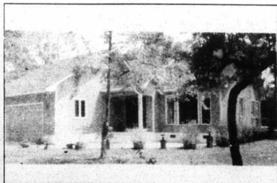
6013 ROBERT RUARK DRIVE. Spacious, open living in this 3-bedroom, 2-bath contemporary in a park-like setting on over one acre. Hardwood floors, loads of kitchen cabinets, Coradco windows, Jenn Air range and underground sprinkler system with well. $119,500.