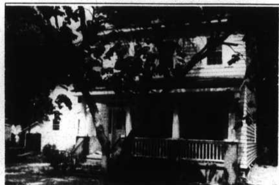
210 LORD STREET. Extensively remodeled 3-bedroom, 2-bath historic home. Fireplaces for wonderful ambience, screened porch for gracious southern living. $148,000.