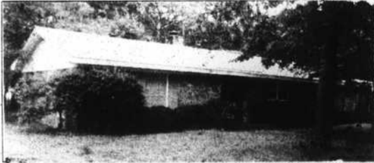
15 AUGUSTA DRIVE. 3-bedroom, 3-bath home with detached garage/guest quarters. Heated workshop and upper heated bedroom and bath. $153,500.